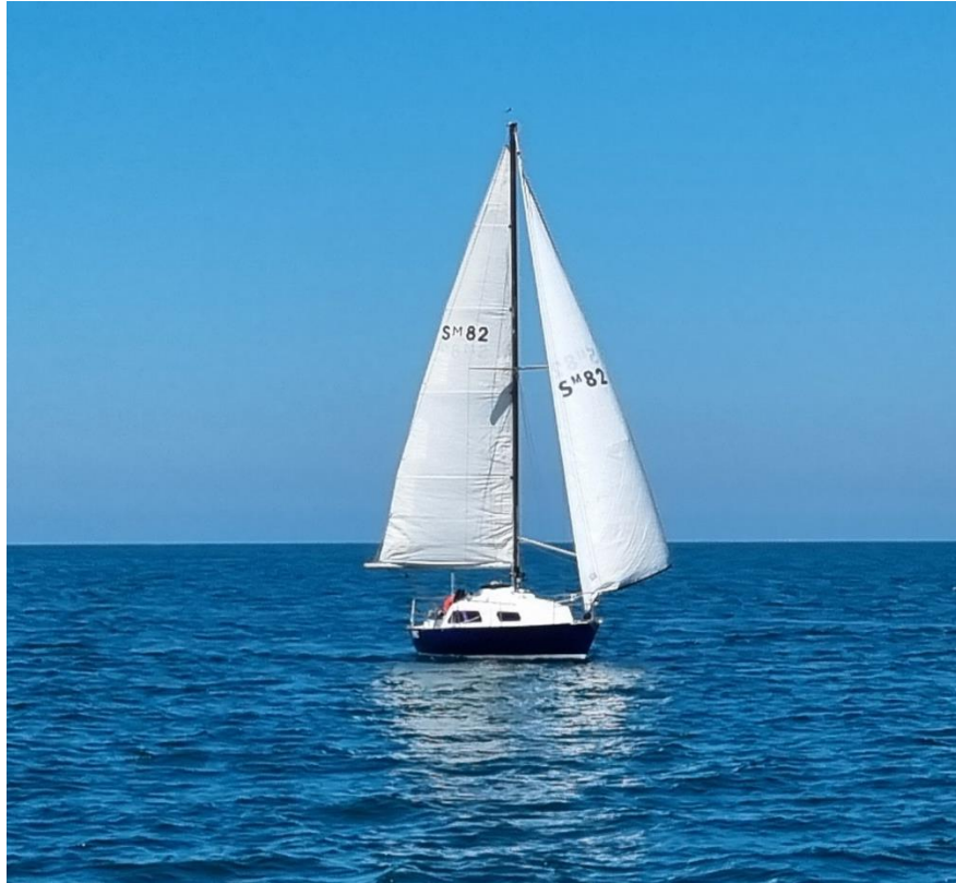
Start of the Day: Isa Lei