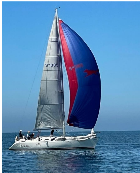
Series Leader Firefox ... Also second today.