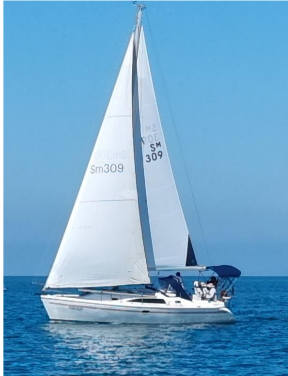
Alegria – third today.