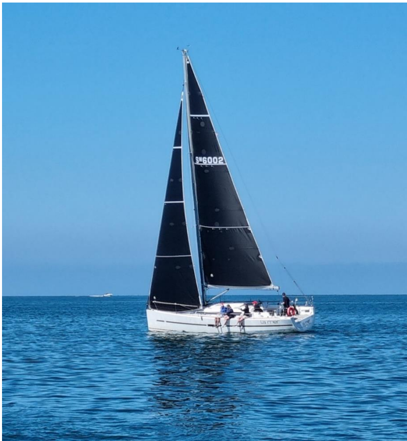
La Mer - equal third in the series.