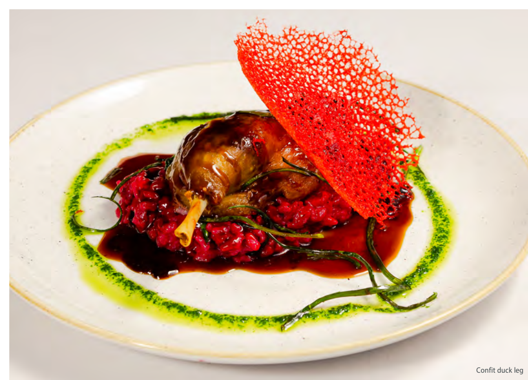
Confit duck leg

Hasselback potato, tomato basil salad, caper berries, balsamic beurre blanc