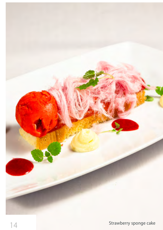
Strawberry sponge cake