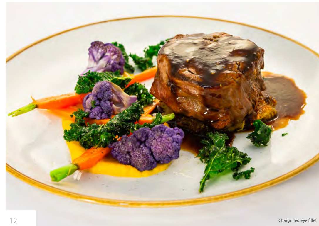
Chargrilled eye fillet