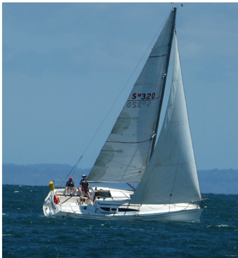
Club Comedie – winner of the series aggregate