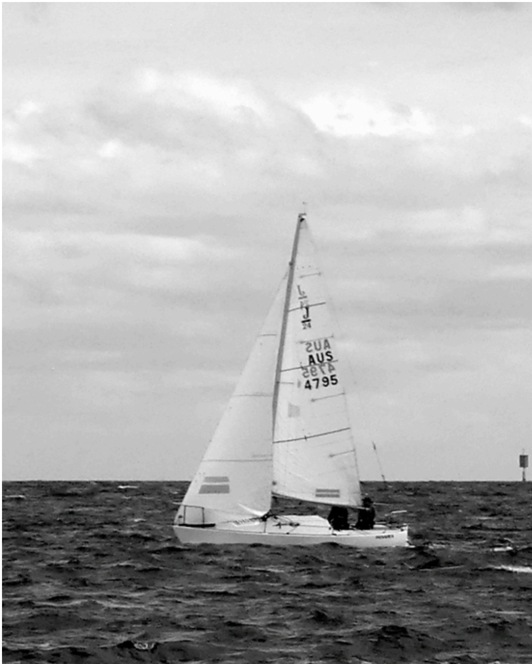
Panarea – 1 st to finish (photographed on a windy day)