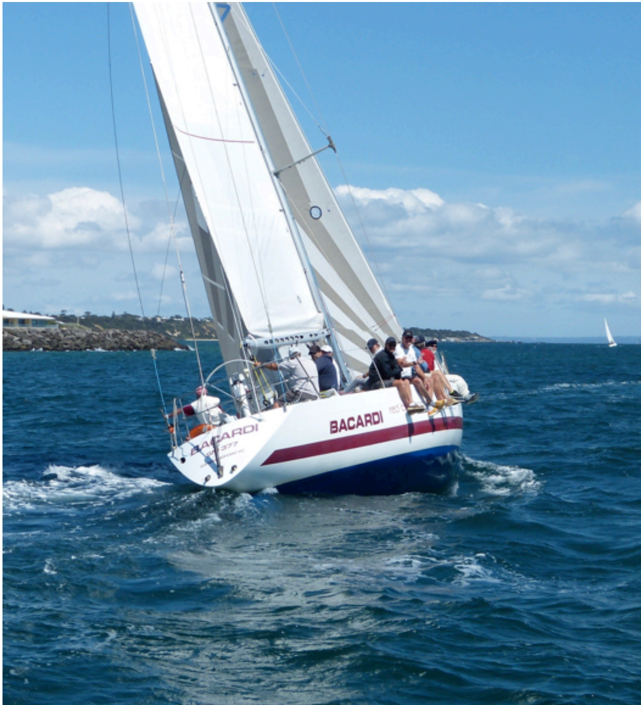
Bacardi – fastest around the course