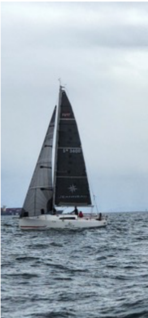
Maverick – 3 rd across the line