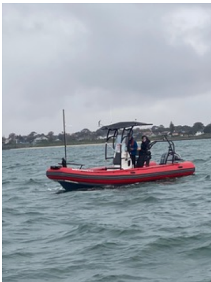
SYC Rescue Rib on station