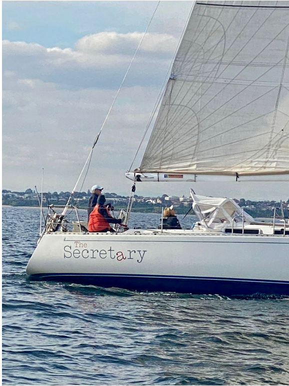
The Secretary – equal 1 st in the Century Class aggregate