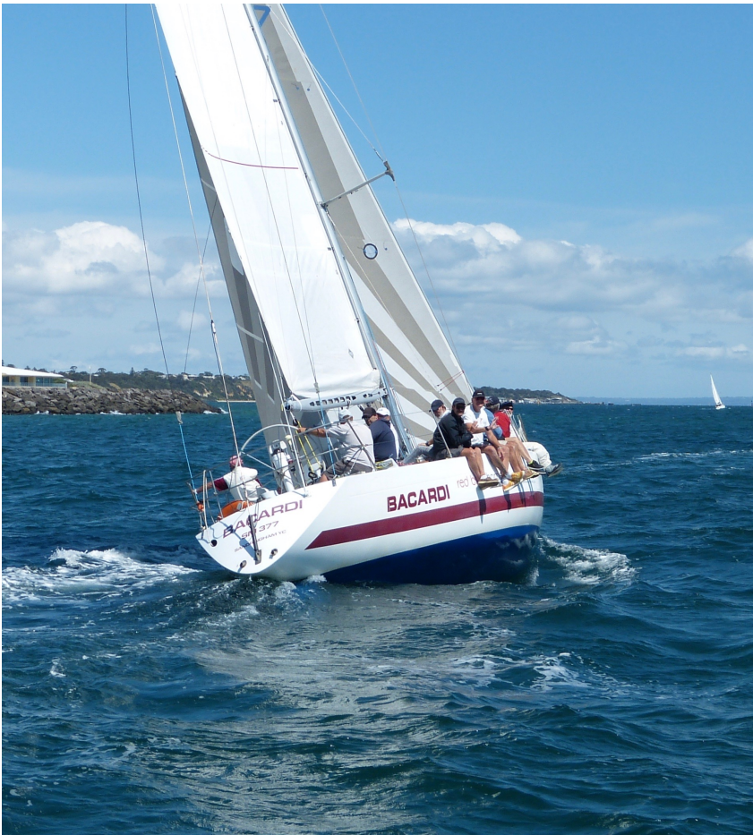
Bacardi – 2 nd across the line