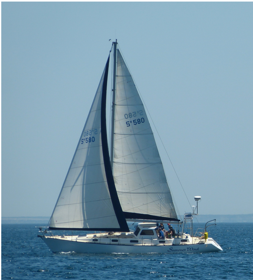
Summer Wind – 1 st to finish