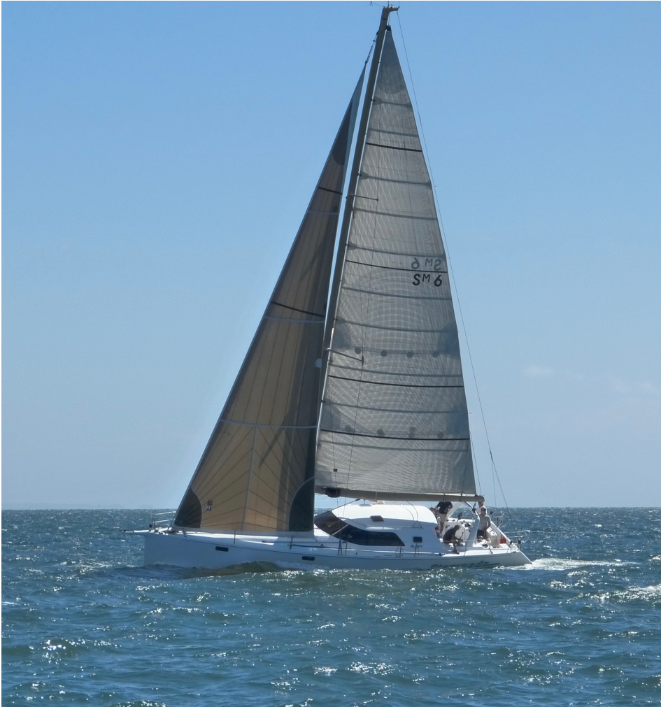
Stampede – fastest around the course