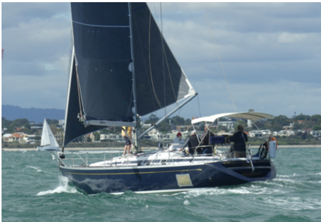
Vixen I - start of the day

Start of the day was won by Vixen I (Christine Matheou-Fox) which crossed the start line just 3 seconds after her allocated start time.