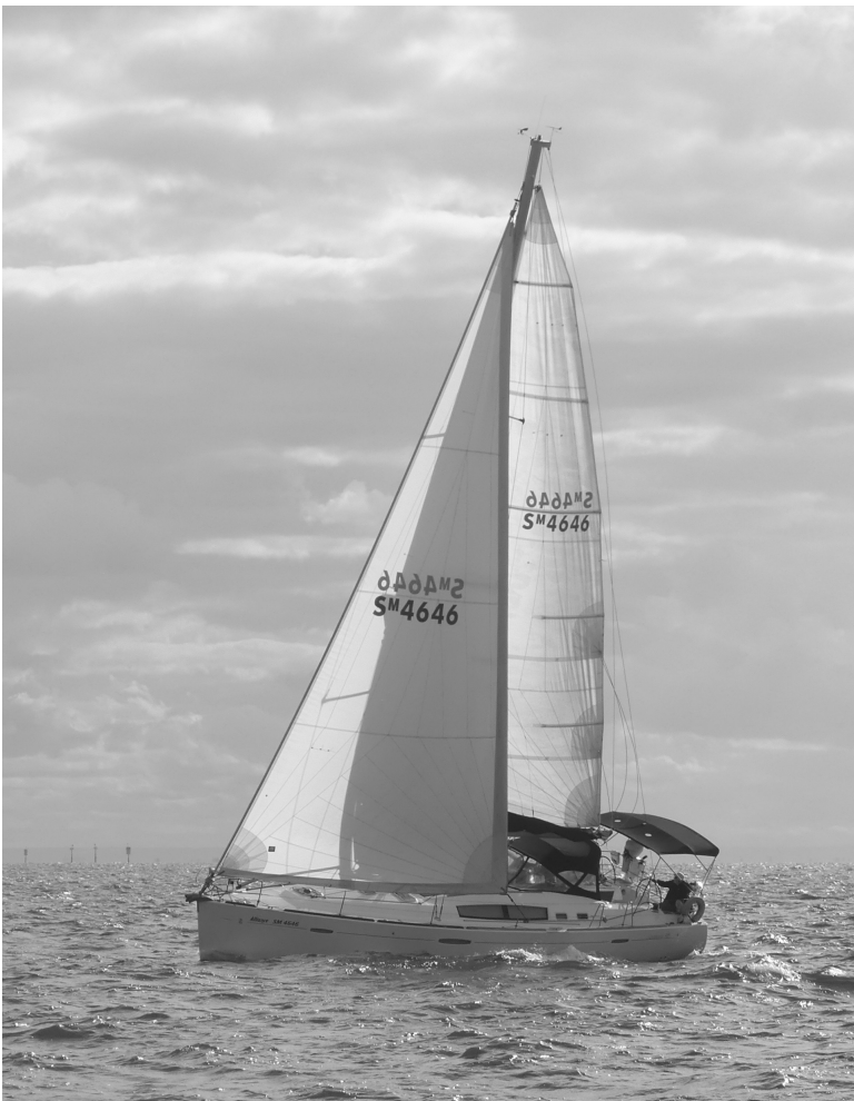
Alliance – 3 rd across the line