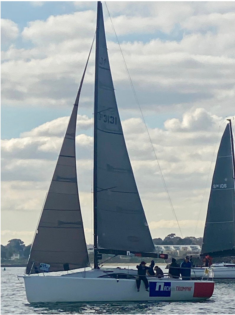
Arch de Triomphe – 2 nd across the line