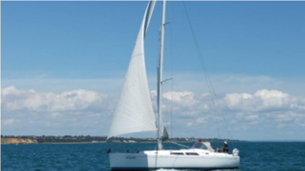
Babydoll – 3 rd across the line