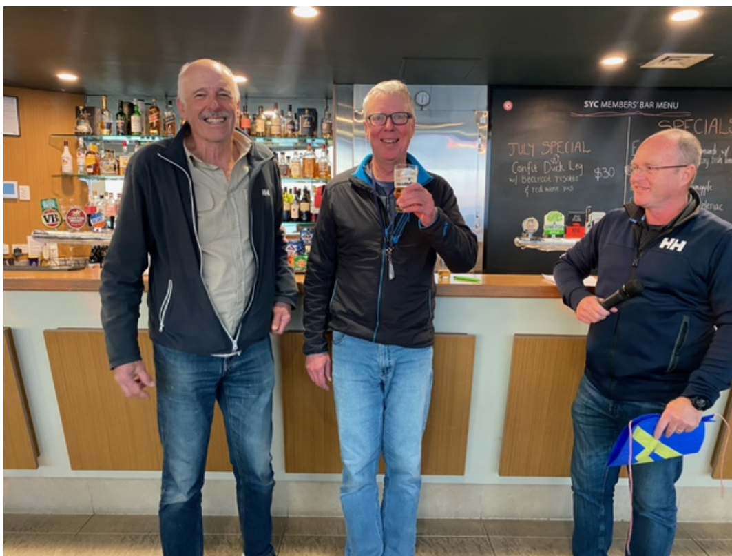
Maverick – 1 st to finish – happy boys