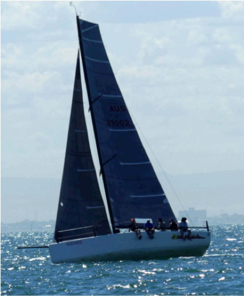
Vindaloo – 2 nd across the line