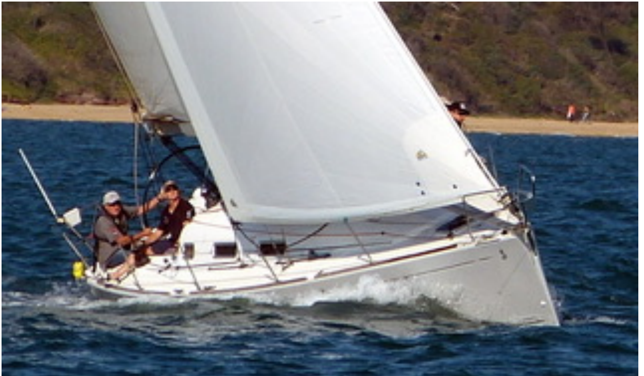
Upbeat – 3 rd across the line