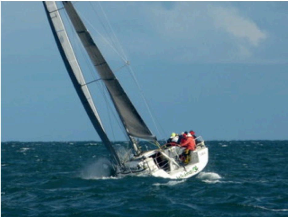
Wicked – fastest on the day (photographed on a windy day)