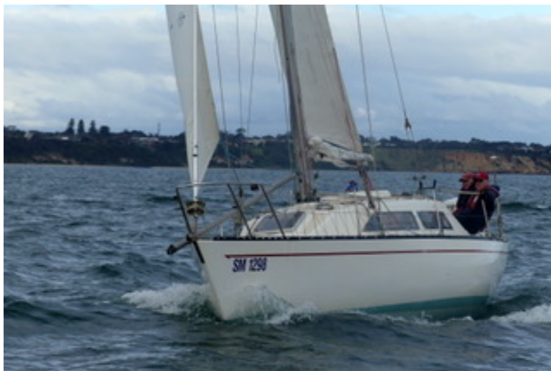
Saltshaker – 1 st across the line