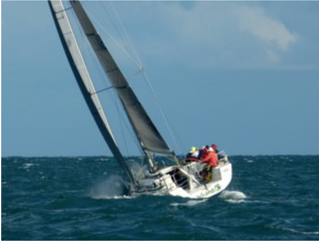
Wicked – fastest on the day