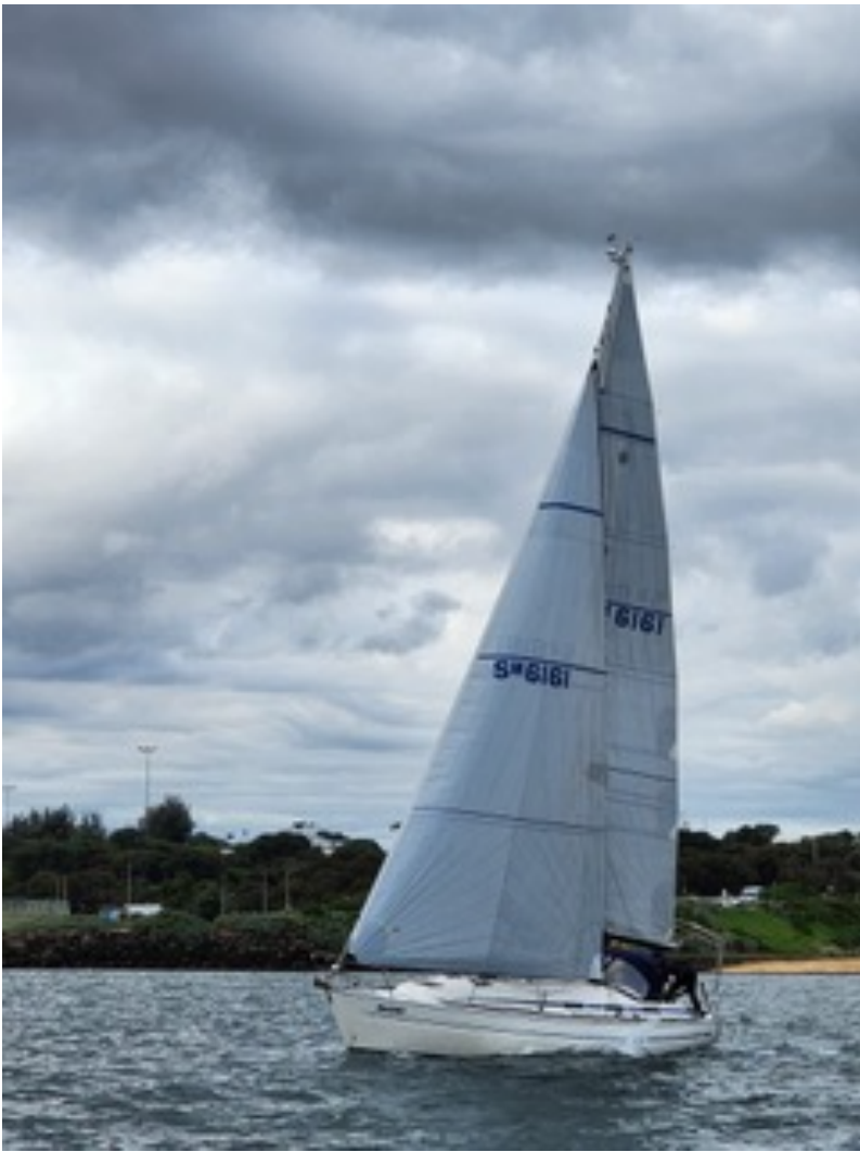
Second Nature – 3 rd across the line