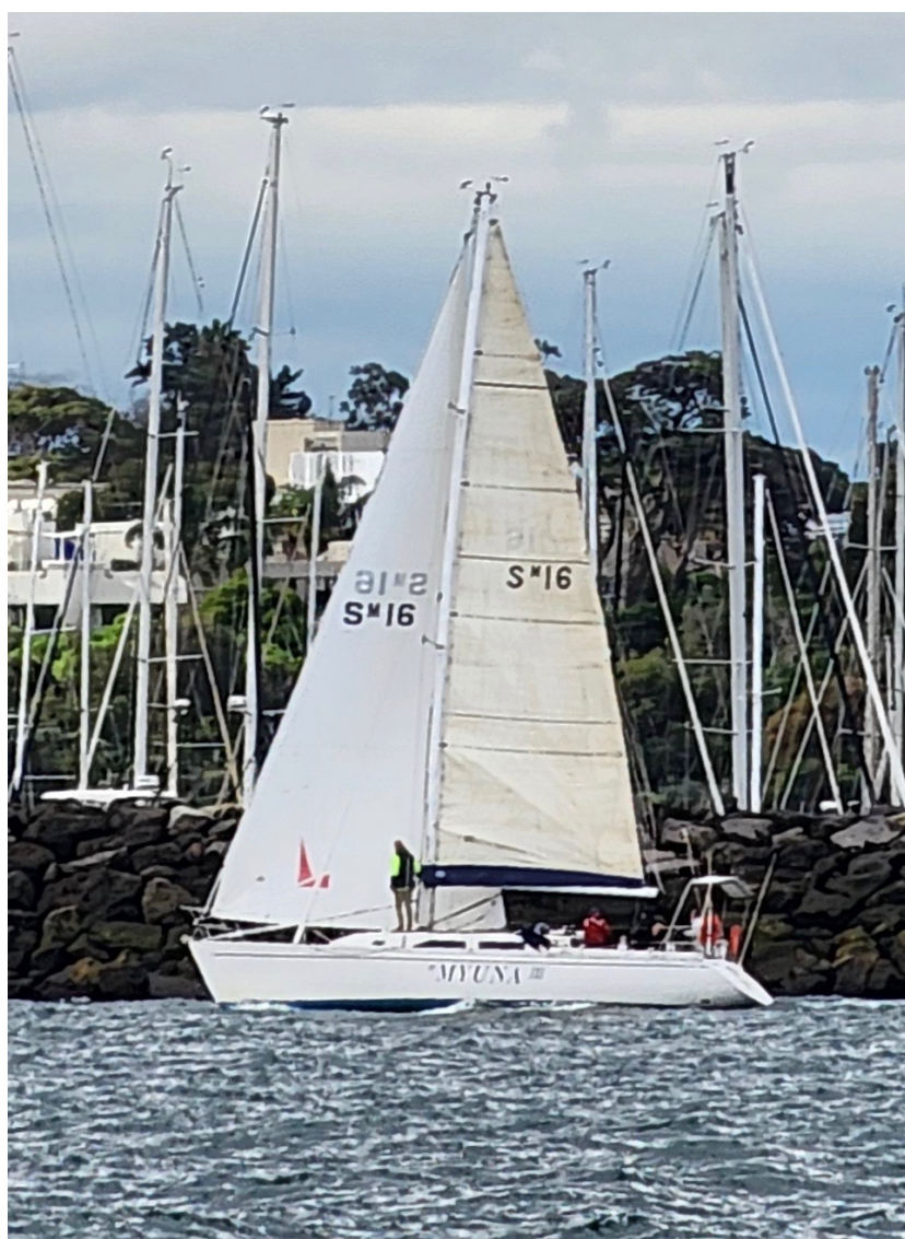
Myuna III – 2 nd across the line