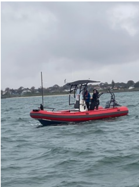
SYC Rescue Rib – on station