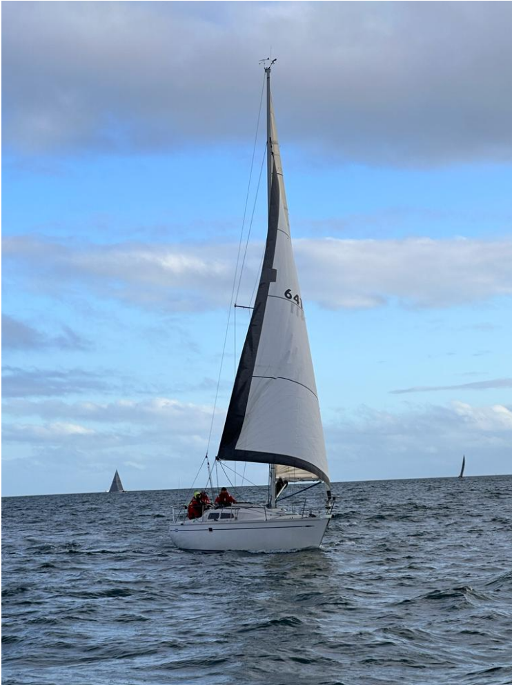
IZZI – 3 rd across the line; 2 nd after adjustment