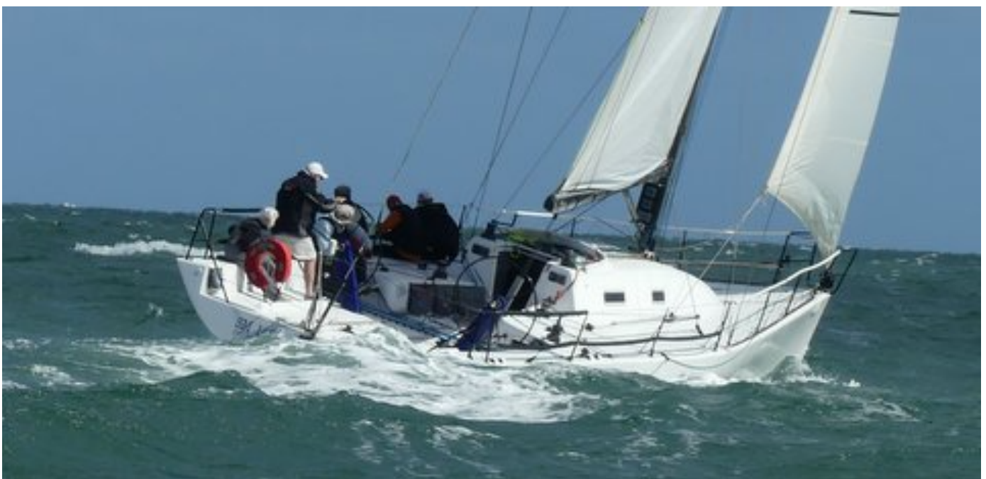
Alex - Team Macadie – fastest on the day

Bacardi (Marin Power) – completed the course in 1:51:35 (before addition of 5 min ENP penalty)