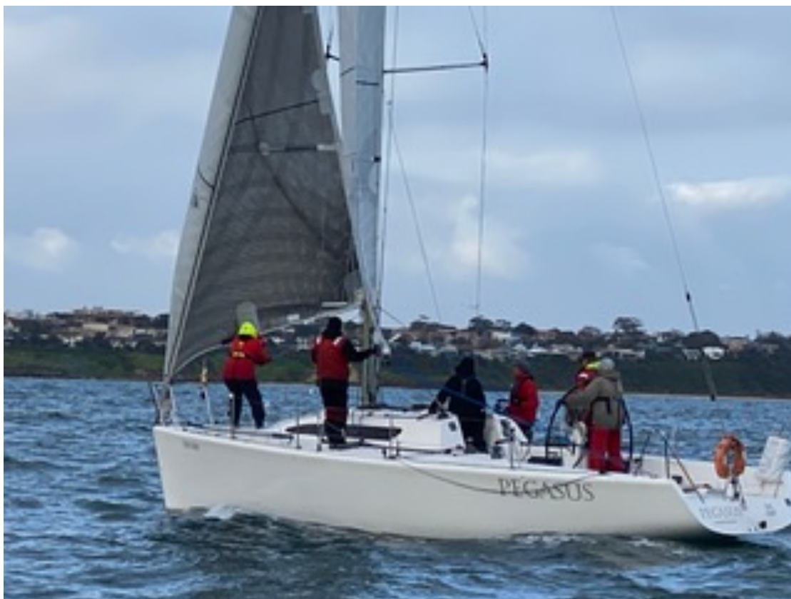
Pegasus – 2 nd across the line; 1 st after adjustment

Bacardi (Martin Power) failed to sign on via MemberPoint and suffered an ENP (event nominated penalty) of 5 min.