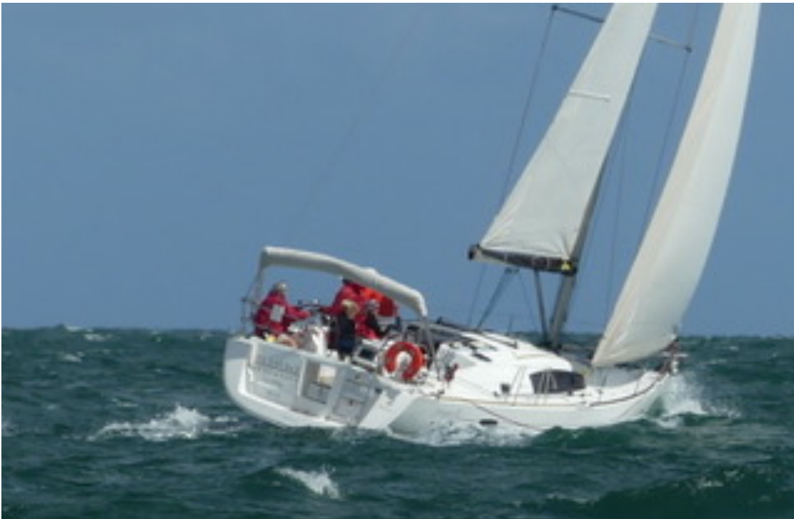
5 O'Clock Somewhere – 1 st across the line; 3 rd after adjustment. It's costly to break the start!