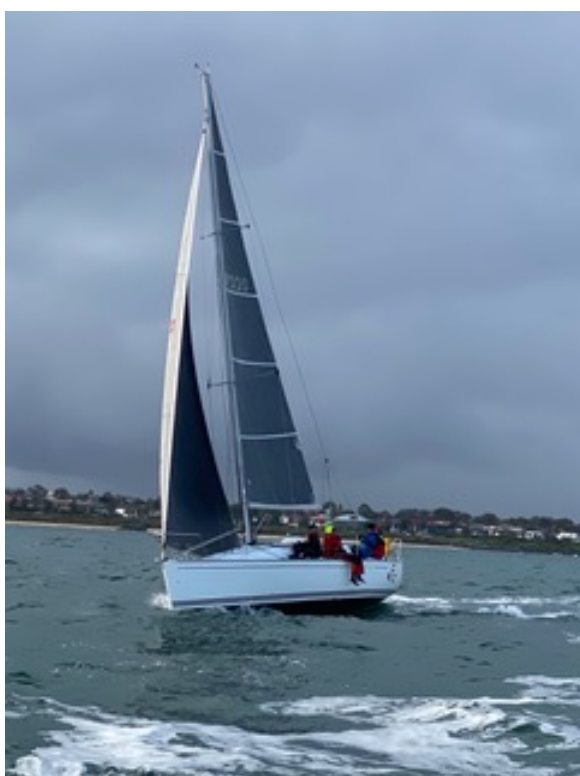
Club Comedie – start of the day

Start of the day went to Club Comedie (Darren Egar) which once again crossed the line a mere 2 sec after her allocated start time.