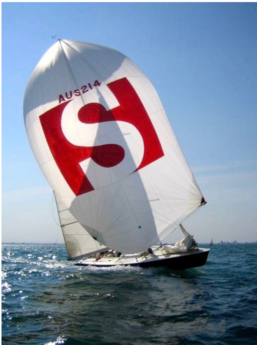
Blue Chip – Chris Carlile's beloved 11 Meter One Design. Quote: "The best little boat in the world mate"

I commend the Club's tribute to Chris. Simply copy the following link into your browser: https://syc.com.au/wp-content/uploads/2023/06/chris-carlile-eneews.png