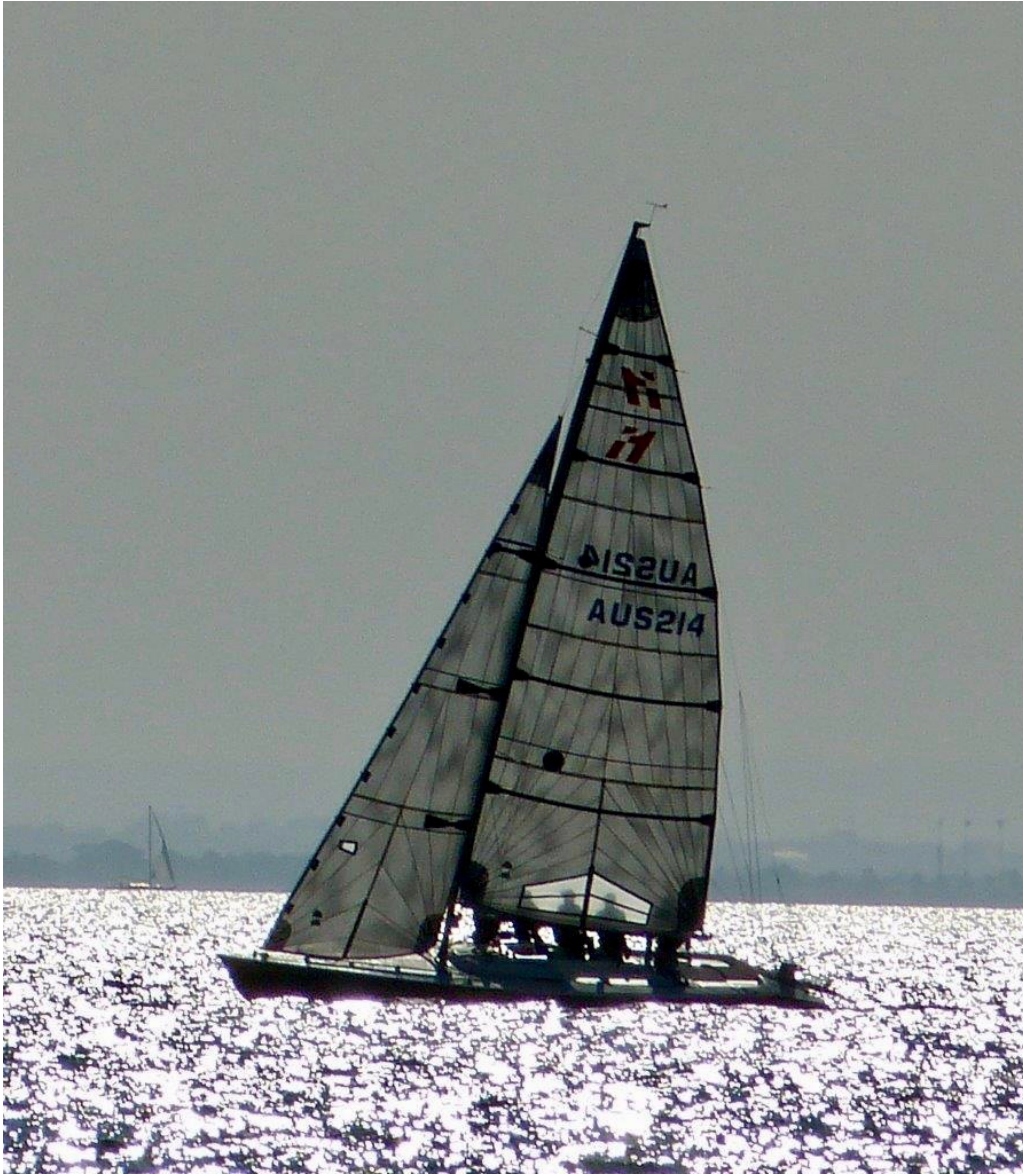
Chris' Blue Chip , heading for the finishing line