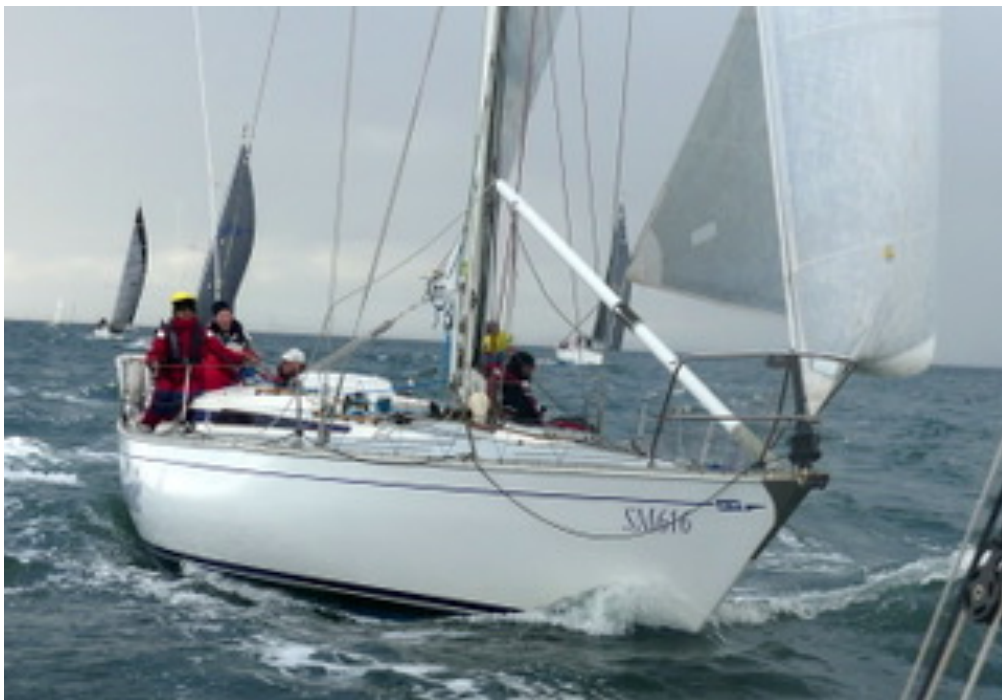
Magic – 2 nd to finish