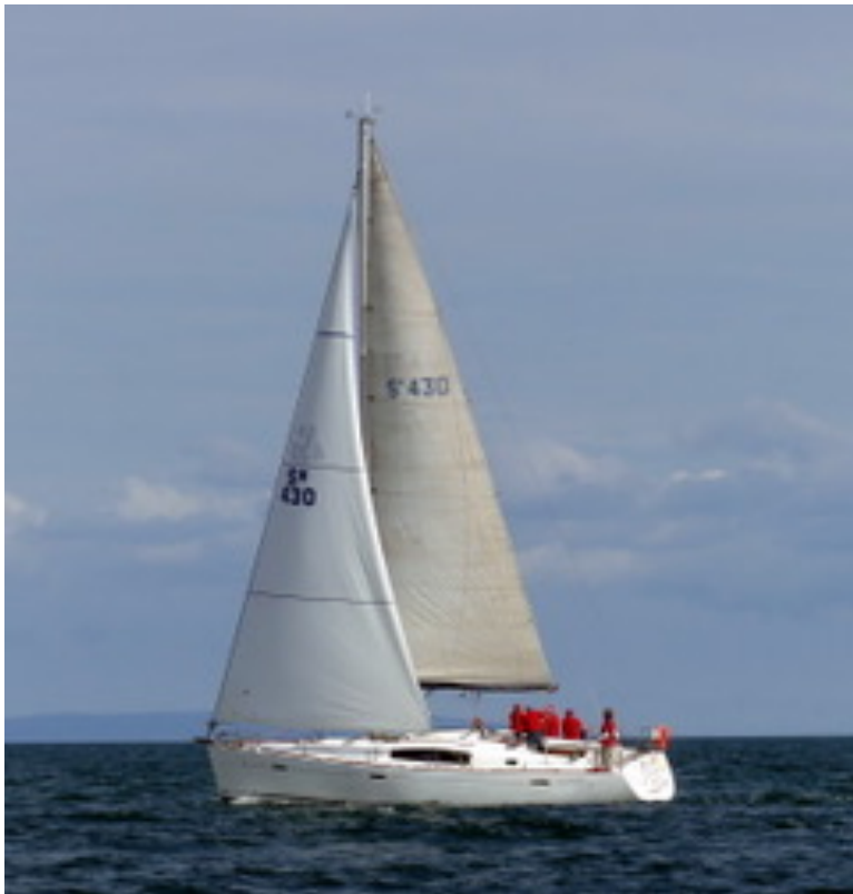
White Pointer – 3 rd to finish