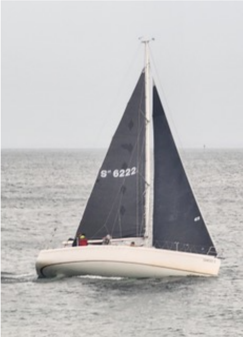
Foggy Dew – 3 rd to finish and before she shook out the reef