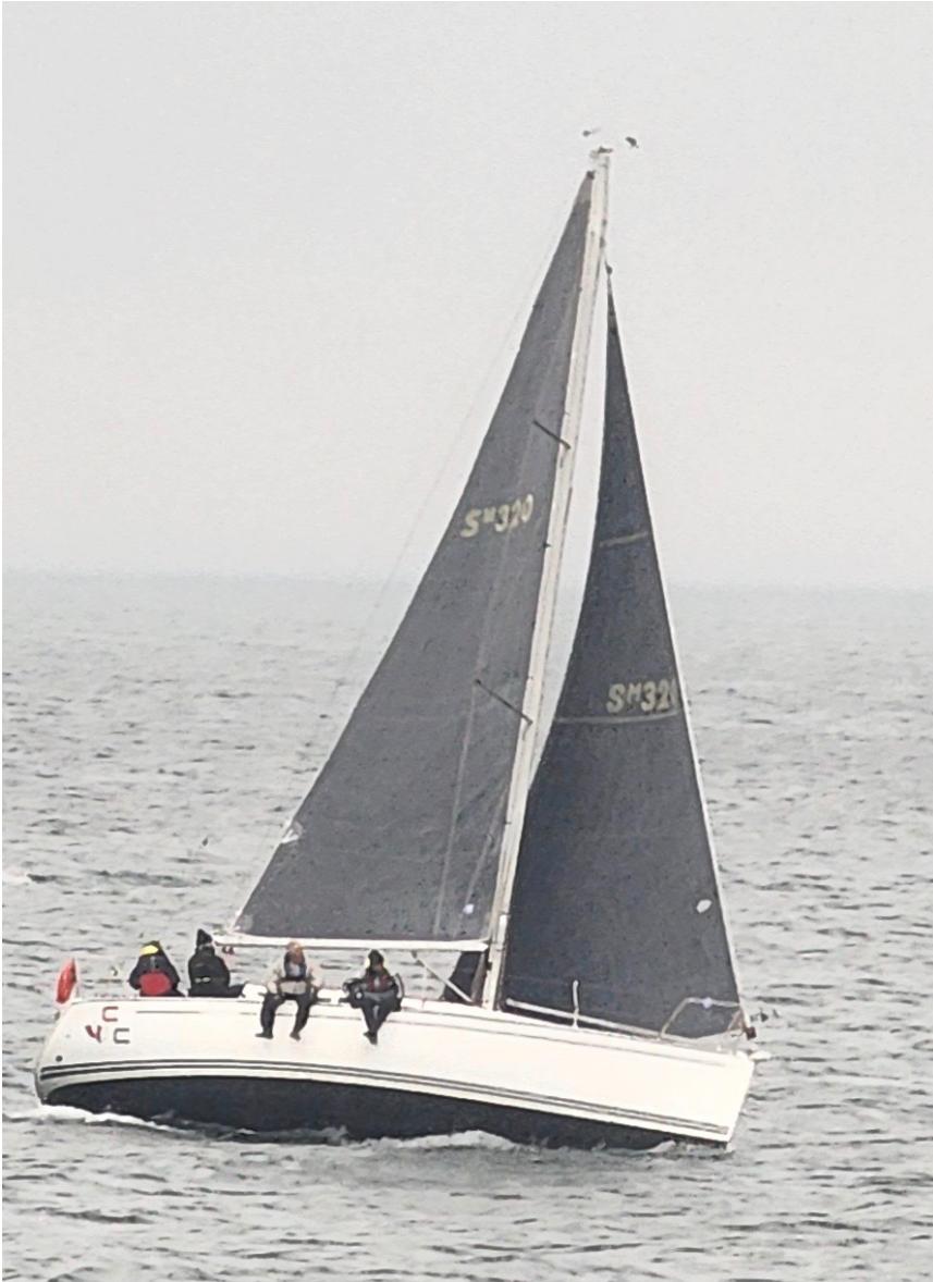
Club Comedie – 1 st to finish