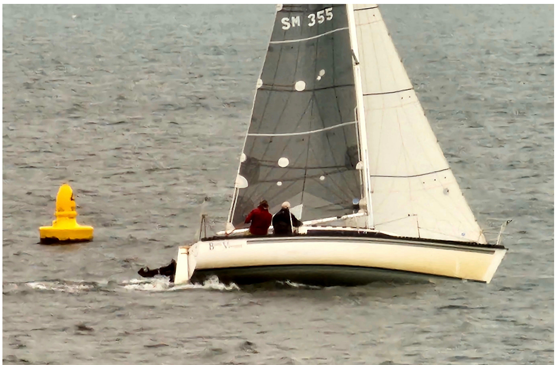
Bon Vivant – 2 nd to finish