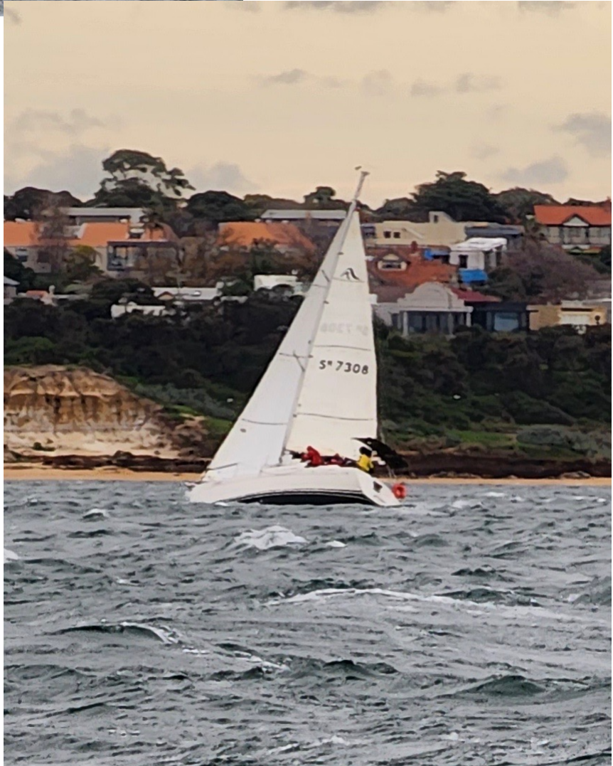
Pzazz – 3 rd to finish