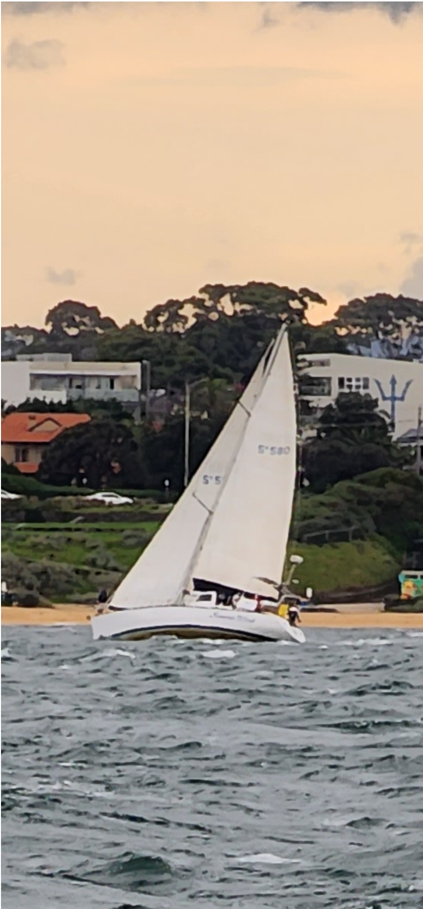
Summer Wind – 1 st to finish