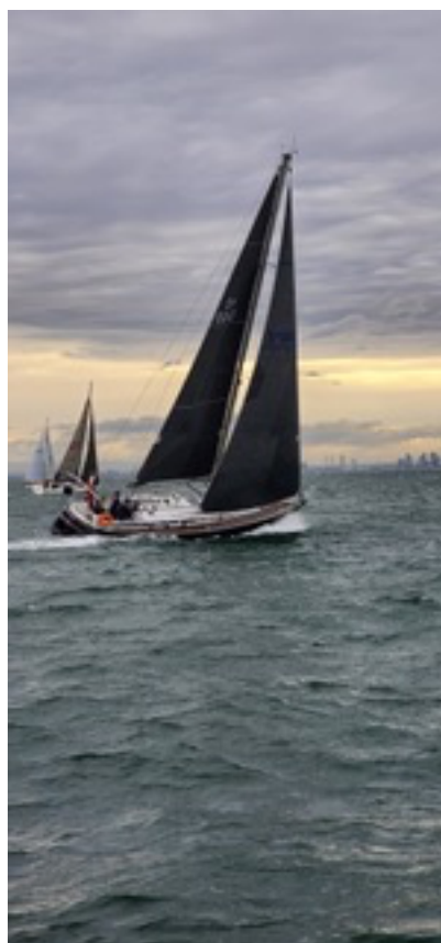
Vixen 1 after a perfect start

Start of the day went to Vixen 1 (Christine Matheou-Fox), which crossed the start line exactly on her allocated start time.