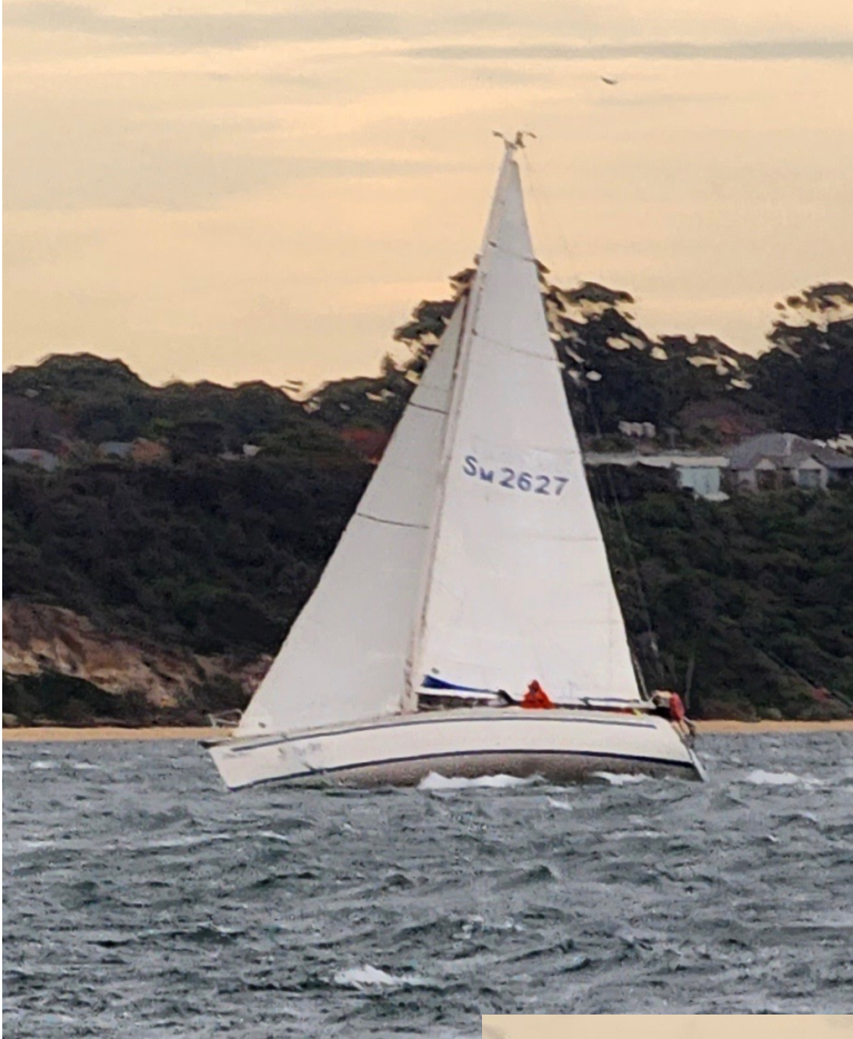
Razzle Dazzleie – 2 nd to finish