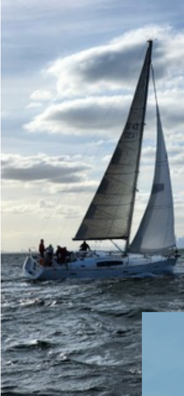
White Pointer – 1 st to finish (and apologies for the low resolution photo)