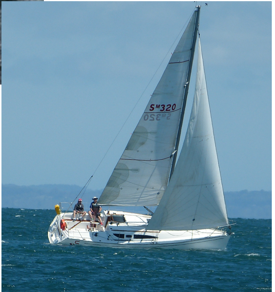
Club Comedie – 2 up and 2 nd to finish