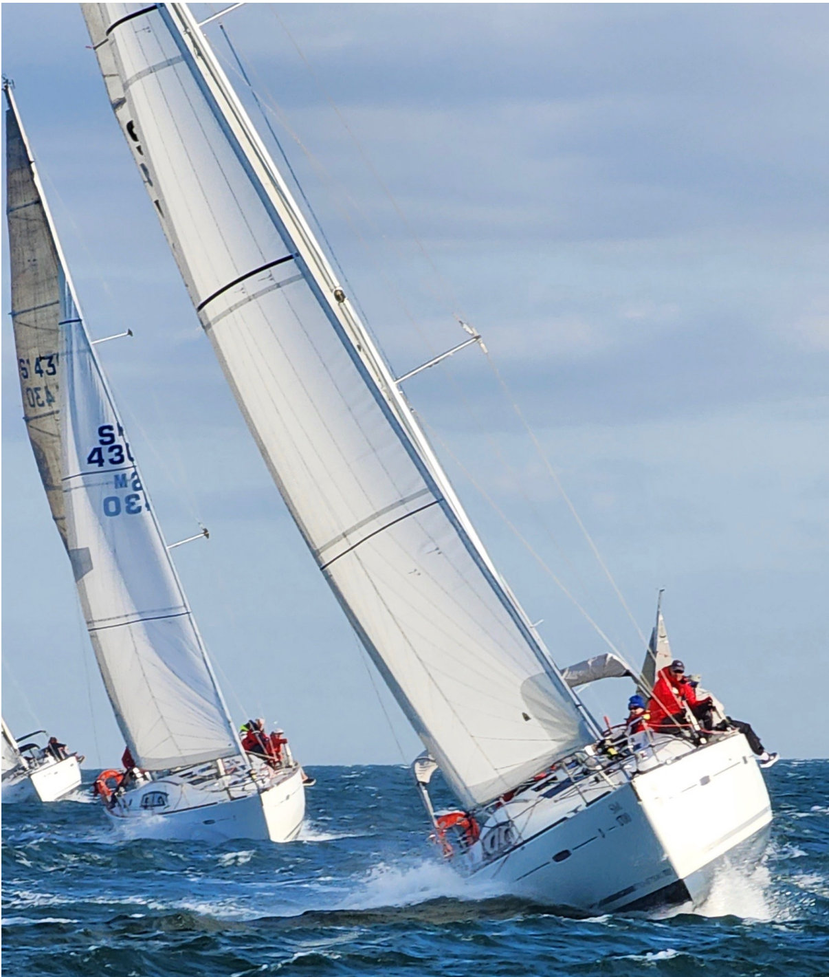
5 O'Clock Somewhere – 3 rd to finish (at this stage, leading White Pointer )