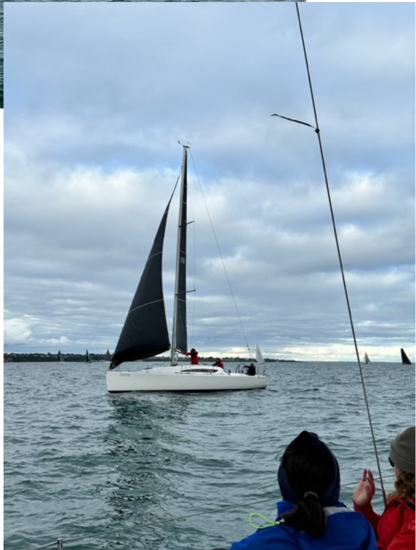
Abili on her way to the front, where she stayed

By the second leg, in the light conditions, the fleet was bunched up