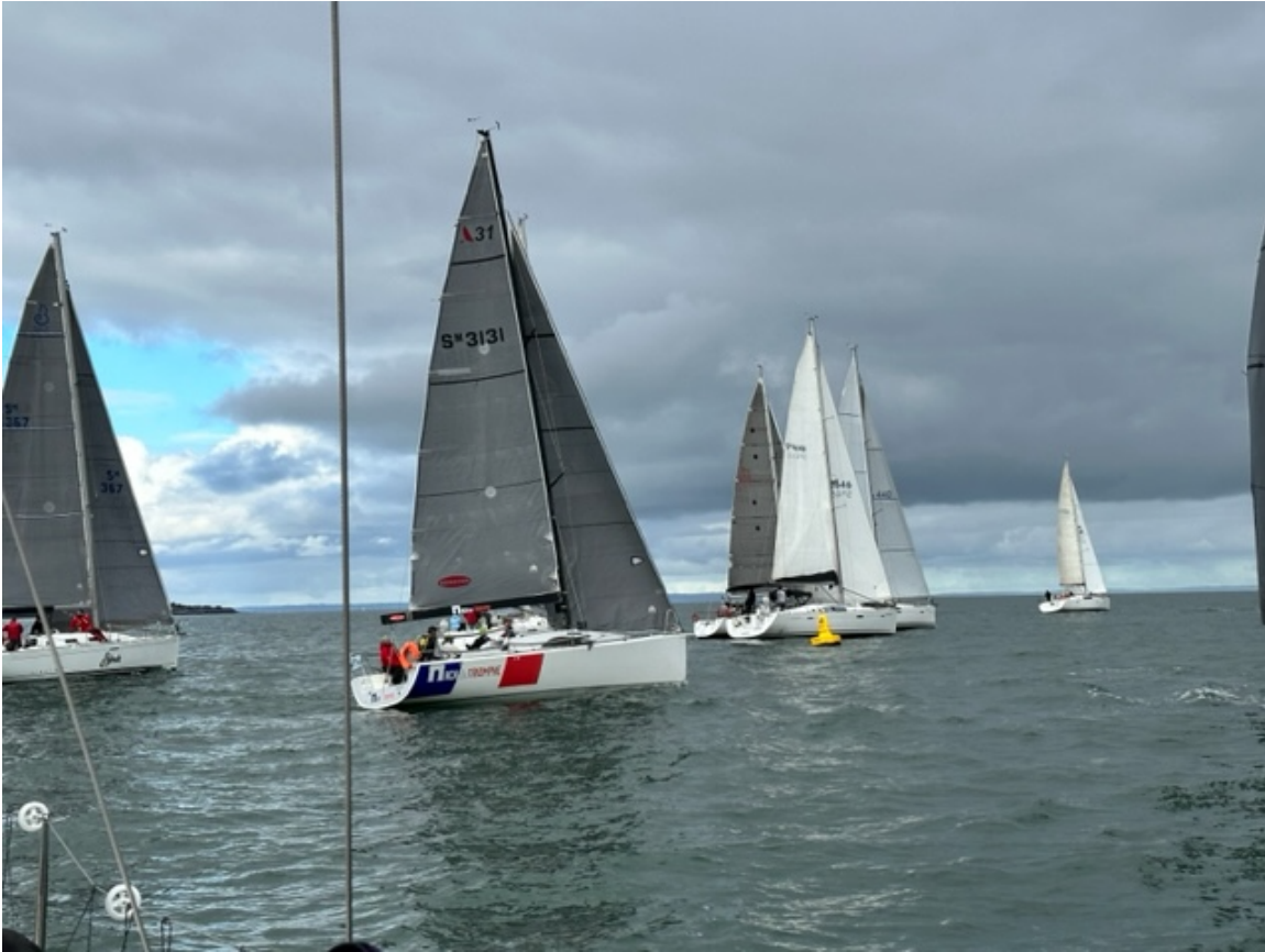
Arch de Triomphe (AM AM) – heading for an almost perfectly timed pursuit start