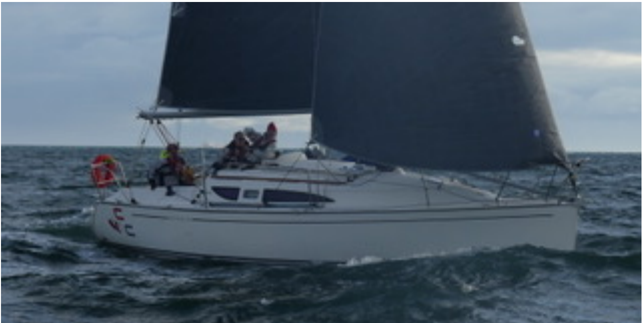
Club Comedie – 1 st home (and start of the day)