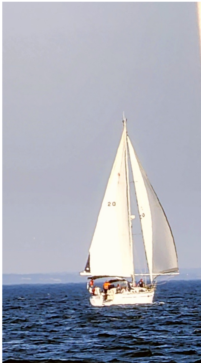
Andante – 2 nd home