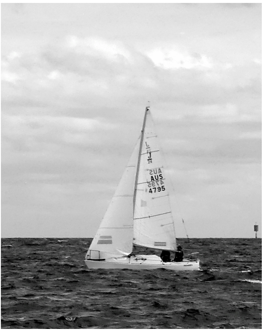
Panarea – 1<sup>st</sup> home