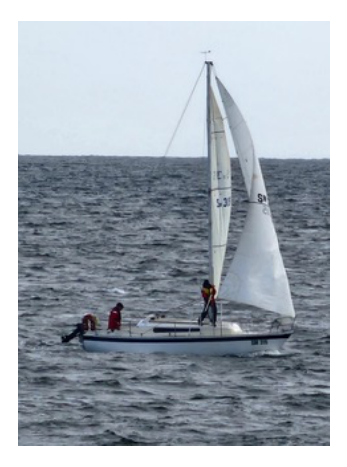
Willarie – 3<sup>rd</sup> home for the second week in succession.