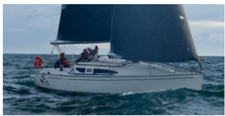
Club Comedie – 2^{nd} across the finish line