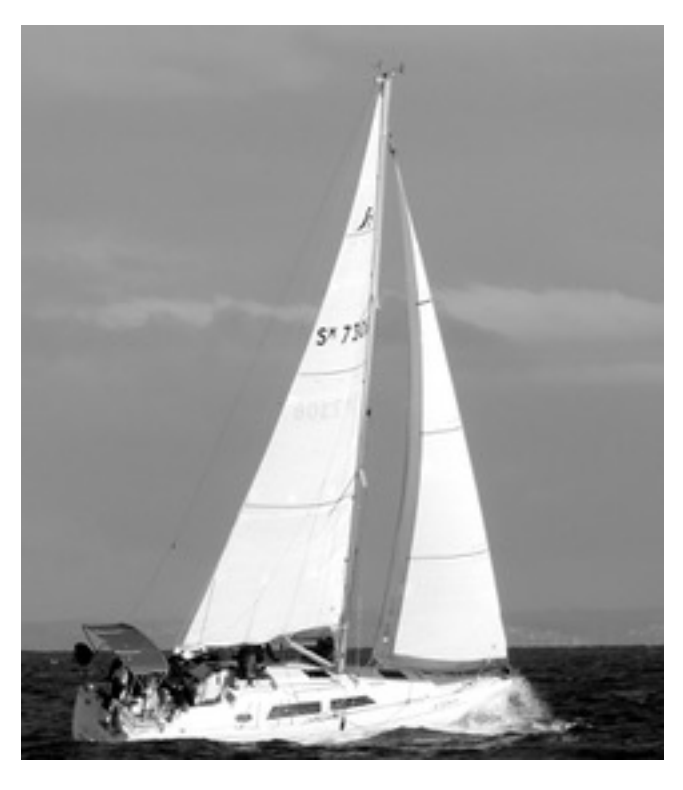
Pzazz – 1<sup>st</sup> to finish