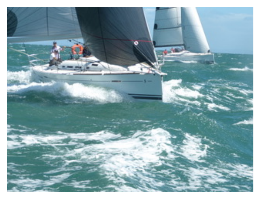
Brannew – fastest around the track (photographed on a windier day)

Brannew (Clive Sondheim) – completed the course in 1:39:43, which was 1 min 21 sec faster than .... Hot Chipps (John Chipp) – completed the course in 1:41:04, which was 1 min 38 sec faster than ... Bacardi (Martin Power) – completed the course in 1:42:42.