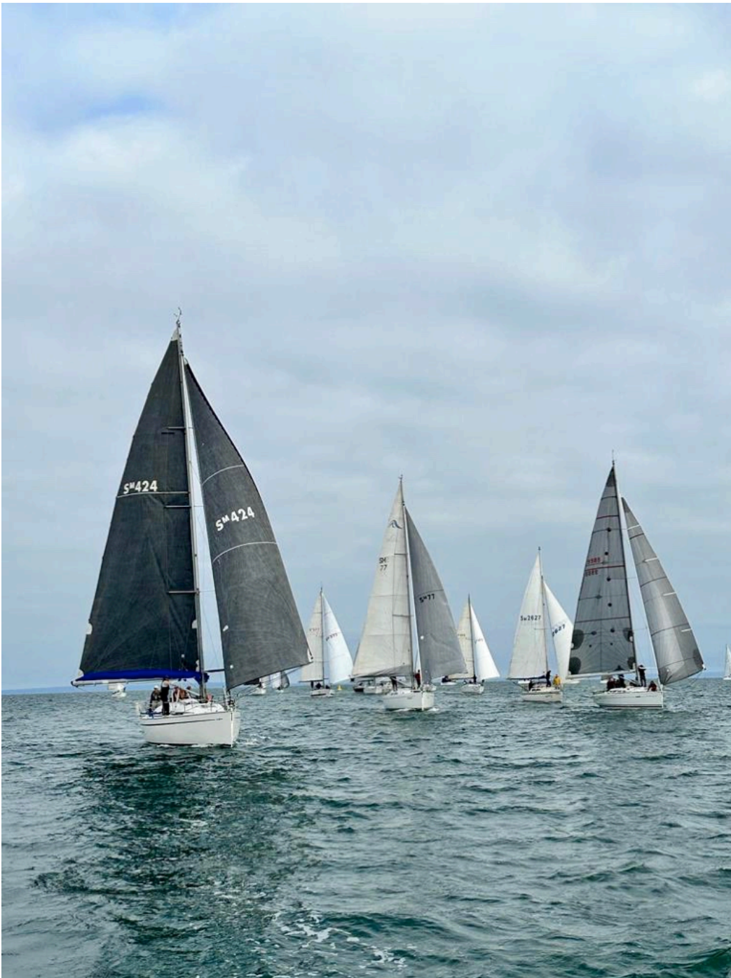
Just rounded SYC4, on way to SYC3