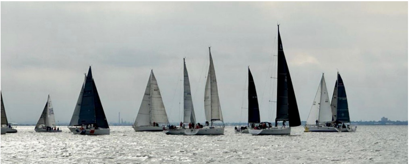
Just rounded SYC3, on way to SYC1