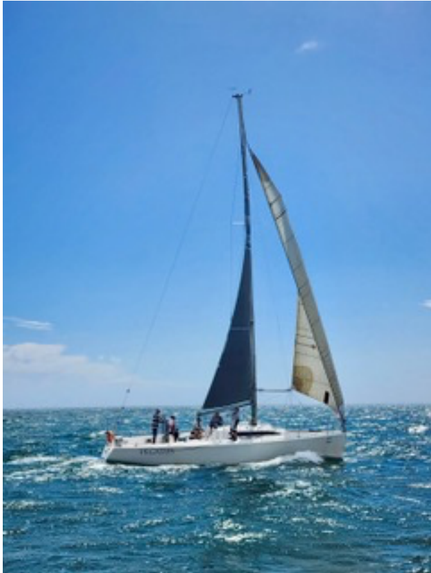
Pegasus – fastest on the day

Bacardi (Martin Power) – completed the course in 1:32:21.