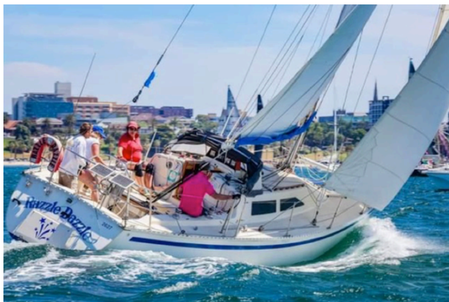
Razzle Dazzle – 1 st in the Century class aggregate.