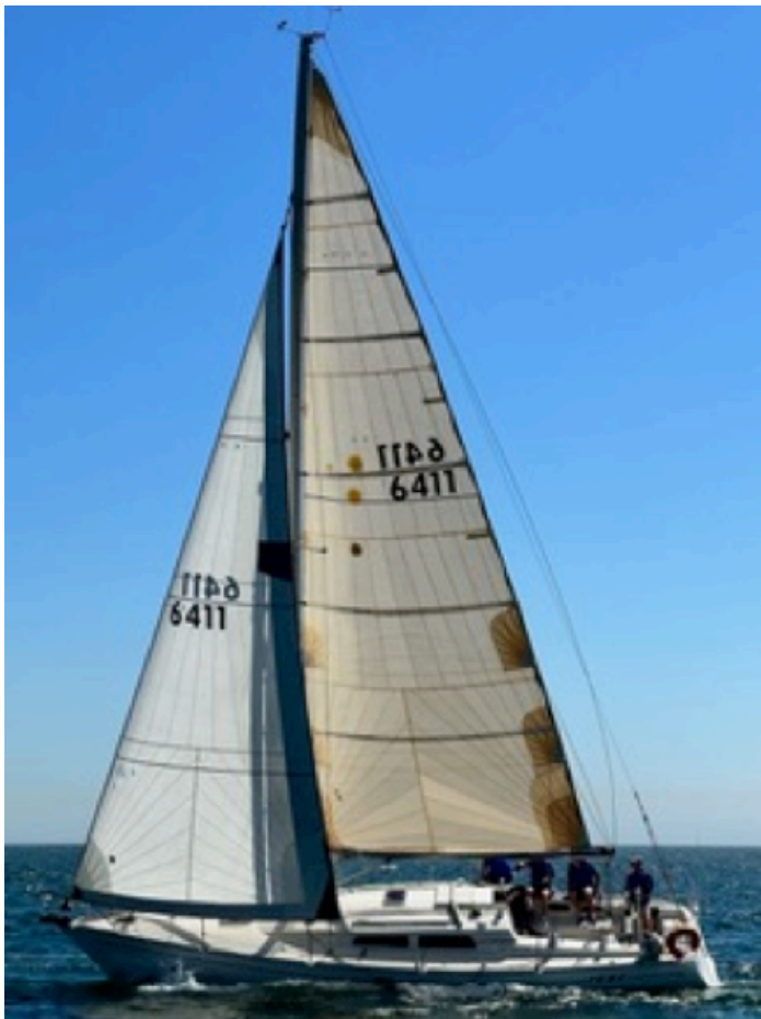
Izzi – 1 st across the line