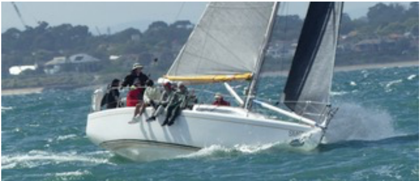
Foggy Dew – winner of the Summer Aggregate