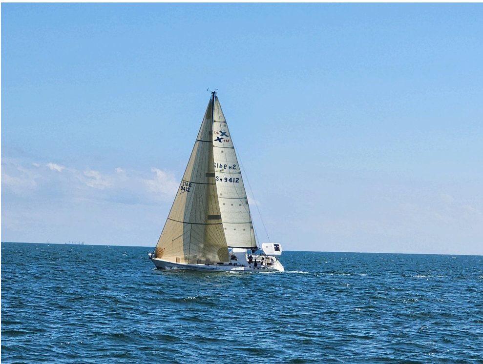
White Onyx , clear of the field and on her way to the 2 nd fastest time