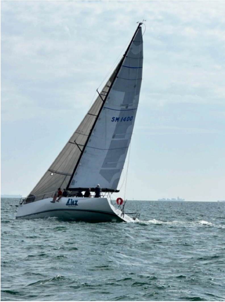
Alex - Team Macadie – fastest on the day, yet again