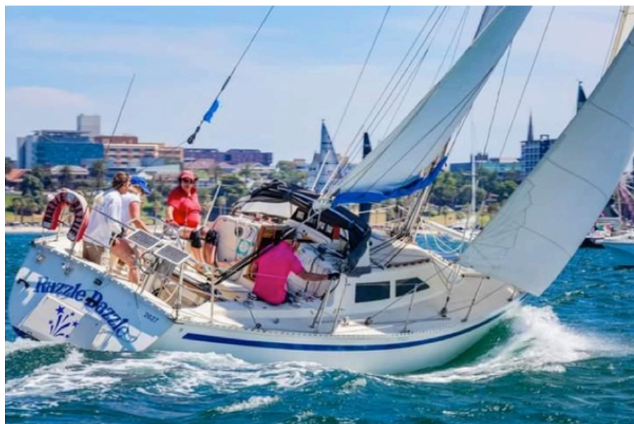
Razzle Dazzle leading the aggregate series.

The top ten leaders in the aggregate competition are: