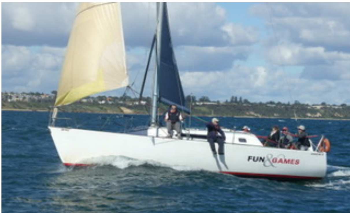
Fun & Games – 1 st across the line