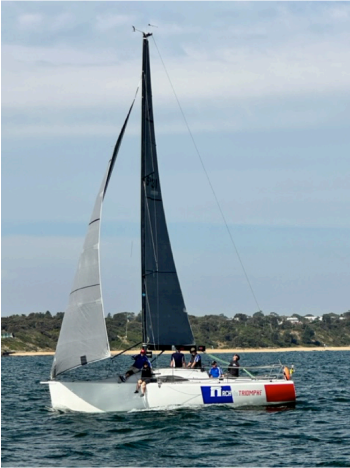
Arch de Triomphe – 3 rd to finish

The following bar chart lists all competitors in the order of their finishing times. The blue bar represents a boat’s elapsed time – each blue bar starts after the elapse of the boat’s handicap and ends after it crosses the finish line.