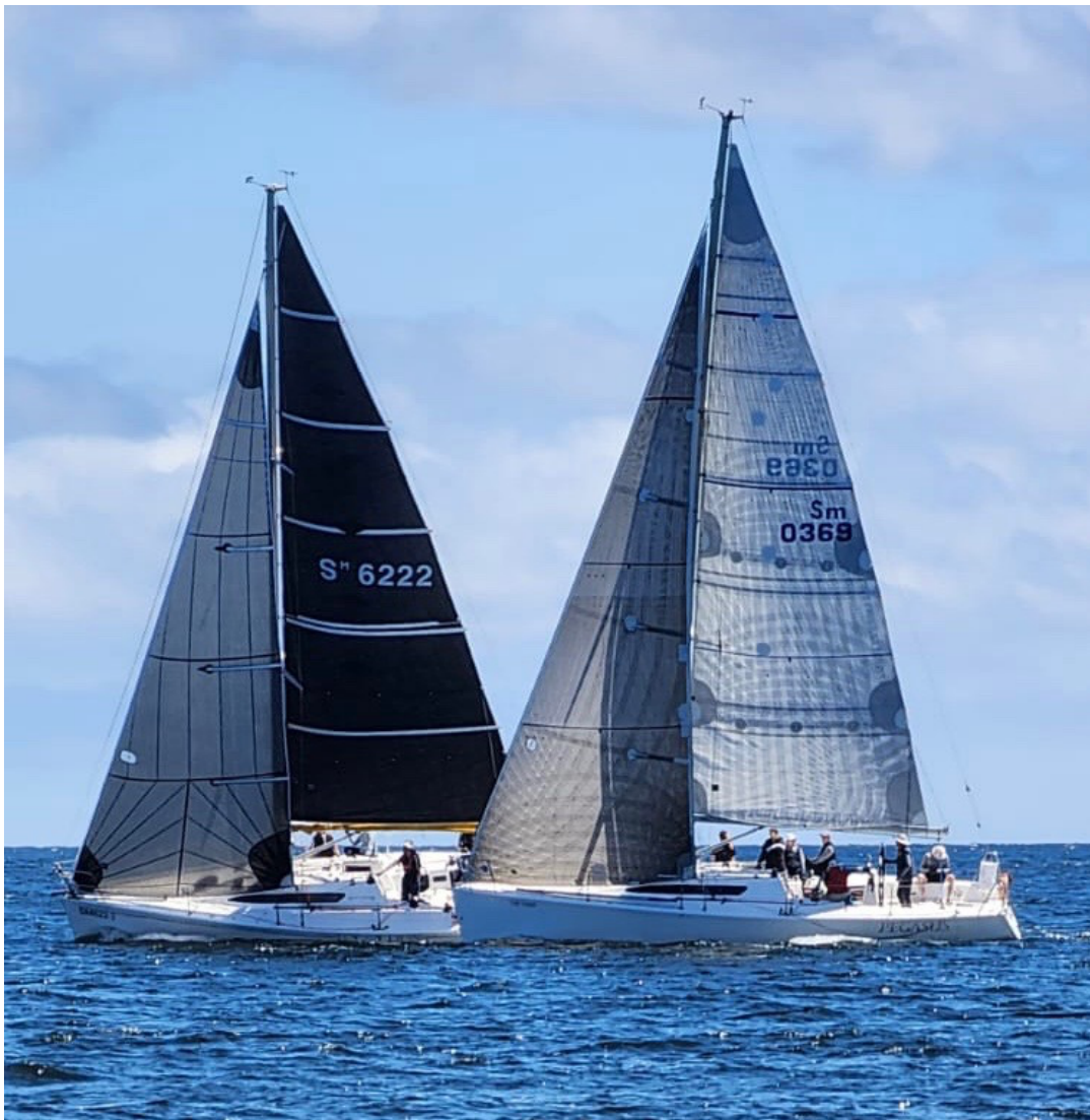
Identical boats: Foggy Dew (windward) and Pegasus (leeward) at close quarters. They finished in that order.