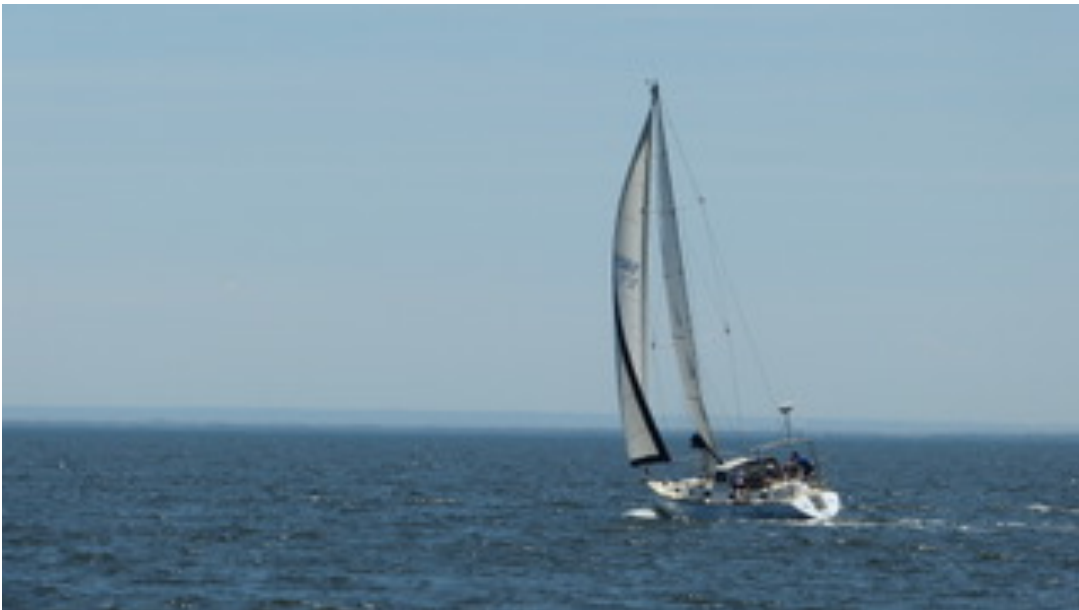
Summer Wind – 3 rd to finish

The following bar chart lists all competitors in the order of their finishing times. The blue bar represents a boat's elapsed time – each blue bar starts after the elapse of the boat's handicap and ends after it crosses the finish line.