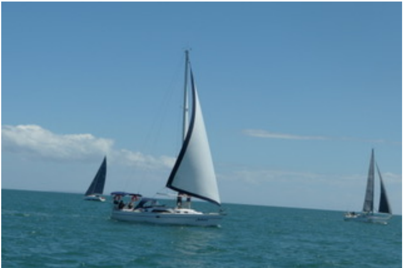
Andante 1 – 1 st to finish the pursuit race.