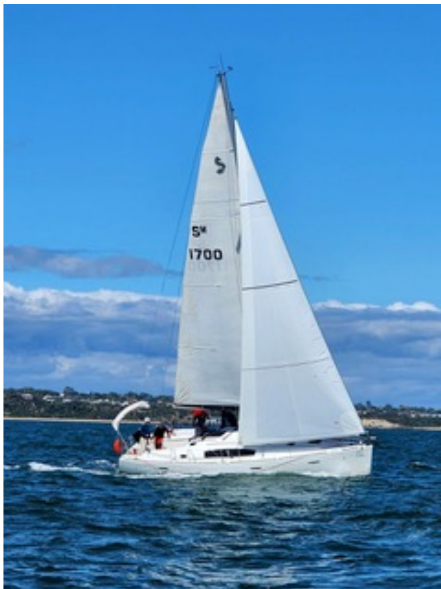
5 O'Clock Somewhere – retains 1 st position in the aggregate competition

The top ten leaders in the aggregate competition are: