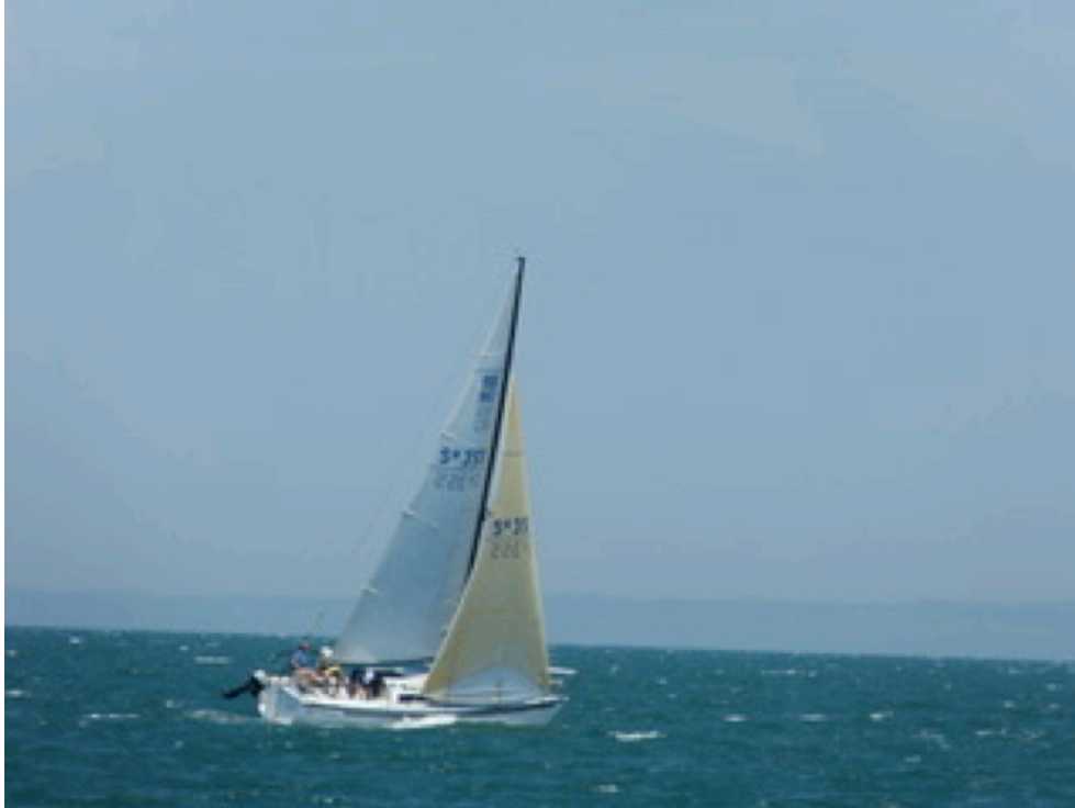
Bon Vivant 1 st to finish the pursuit race.

The following bar chart lists all competitors in the order of their finishing times. The blue bar represents a boat's elapsed time – each blue bar starts after the elapse of the boat's handicap and ends after it crosses the finish line.