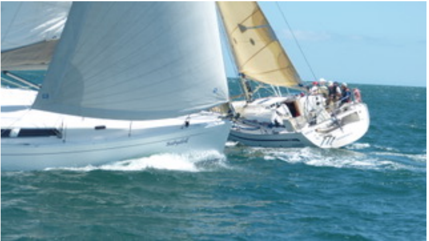
Barnstormer (2 nd to finish) crosses Babydoll (3 rd to finish)

The following bar chart lists all competitors in the order of their finishing times. The blue bar represents a boat's elapsed time – each blue bar starts after the elapse of the boat's handicap and ends after it crosses the finish line.