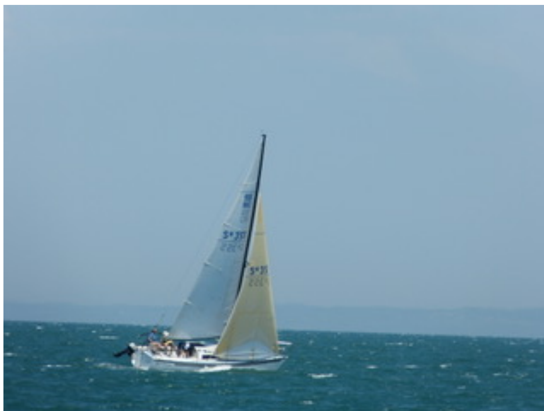
Bon Vivant going nicely

[ Editorial note : Most weeks, this report profiles a Wednesday Wonders boat and its helmsperson / owner. So at some time in the near future, you will receive a request to provide a profile of your boat and its crew. It shouldn't read like a sales advert for the boat nor a job application for the helmsperson; just simple facts sprinkled with a little fiction. ]