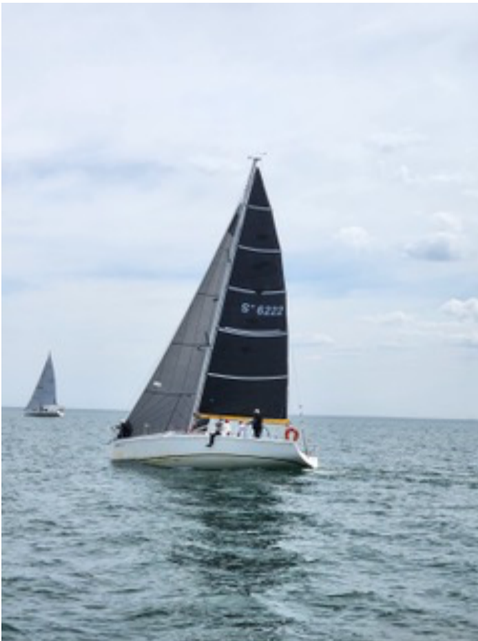
Foggy Dew - moves into 2 nd spot