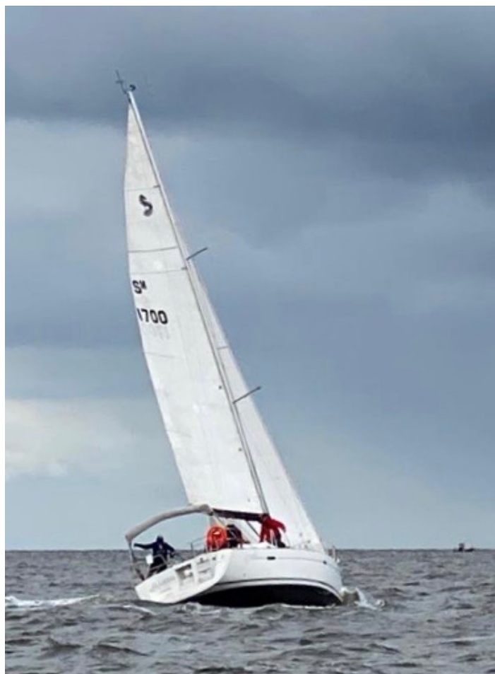
5 O'Clock Somewhere – returns to the podium

The top ten leaders in the aggregate competition are: