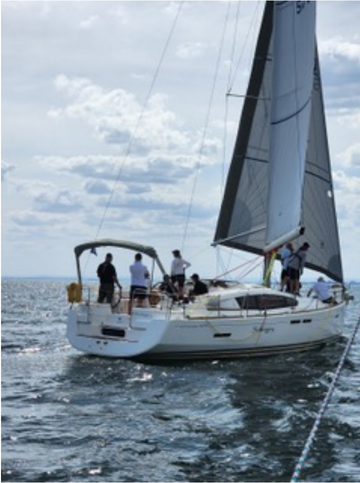
Skulduggery – retains 1 st position in the aggregate competition