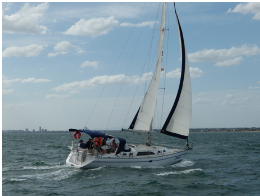
Andante 1 – 3 rd place

The following bar chart lists all competitors in the order of their finishing times. The blue bar represents a boat's elapsed time – each blue bar starts after the elapse of the boat's handicap and ends after it crosses the finish line.