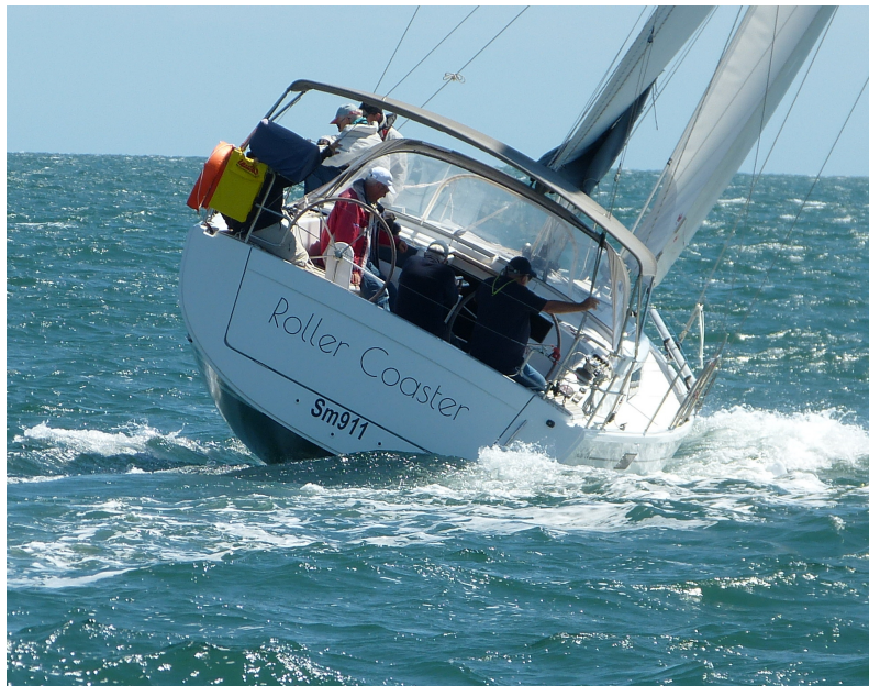
Roller Coaster – 2 nd across the line.