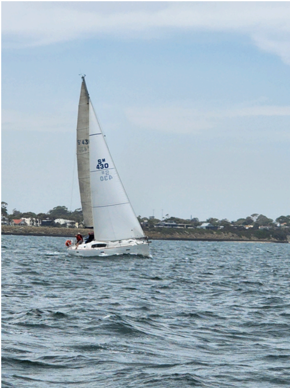
White Pointer – moves into 2 nd position in the aggregate