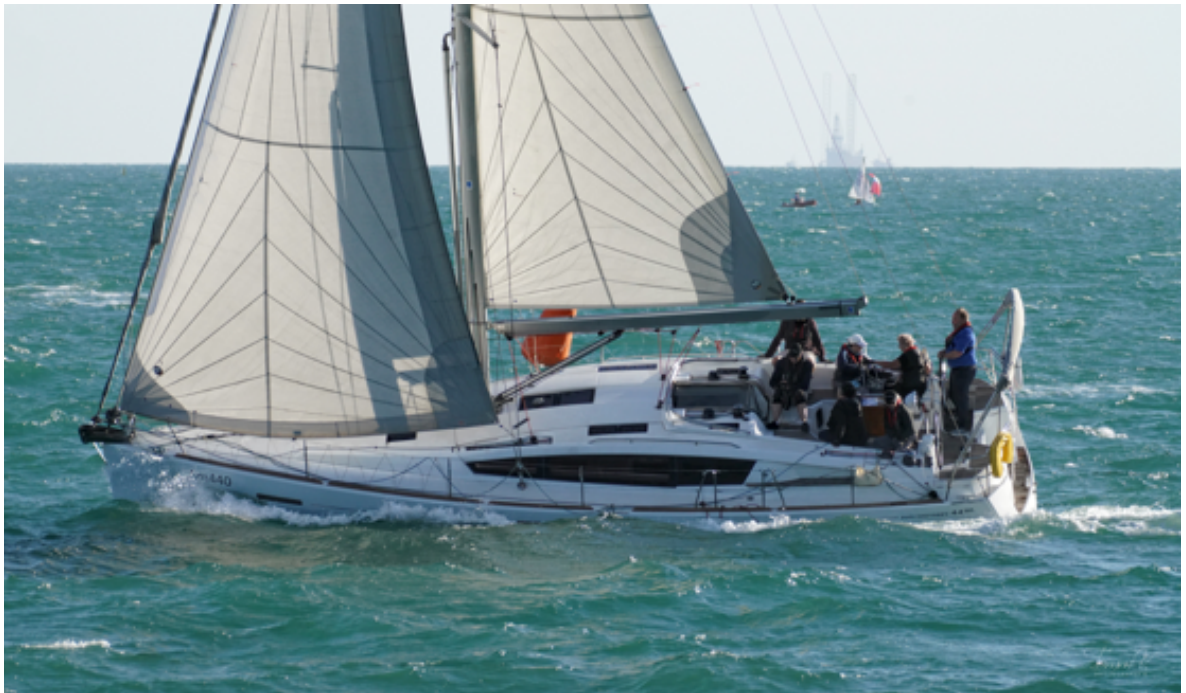
Skullduggery – moves to 1 st position in the aggregate competition