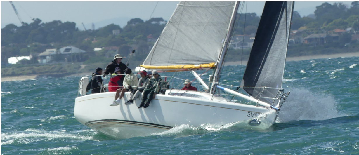
Foggy Dew – 2 nd in the aggregate series (on count-back); equal points to series leader.

The top ten leaders in the aggregate competition are: