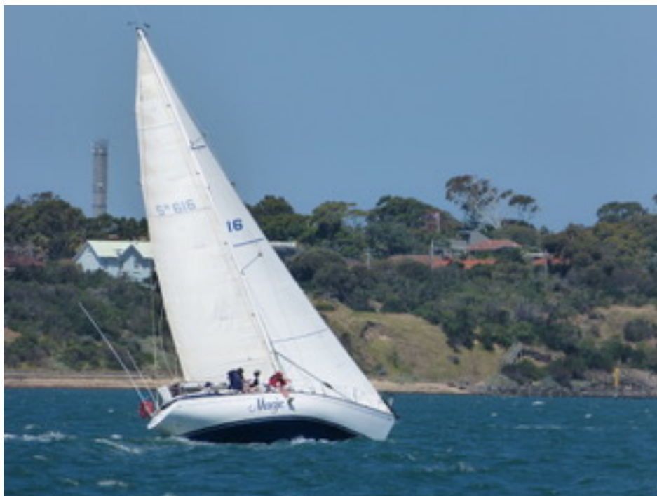
Magic – 3 rd place