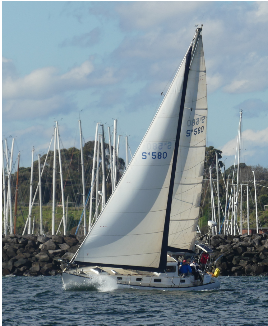
Summer Wind – 2 nd across the line.