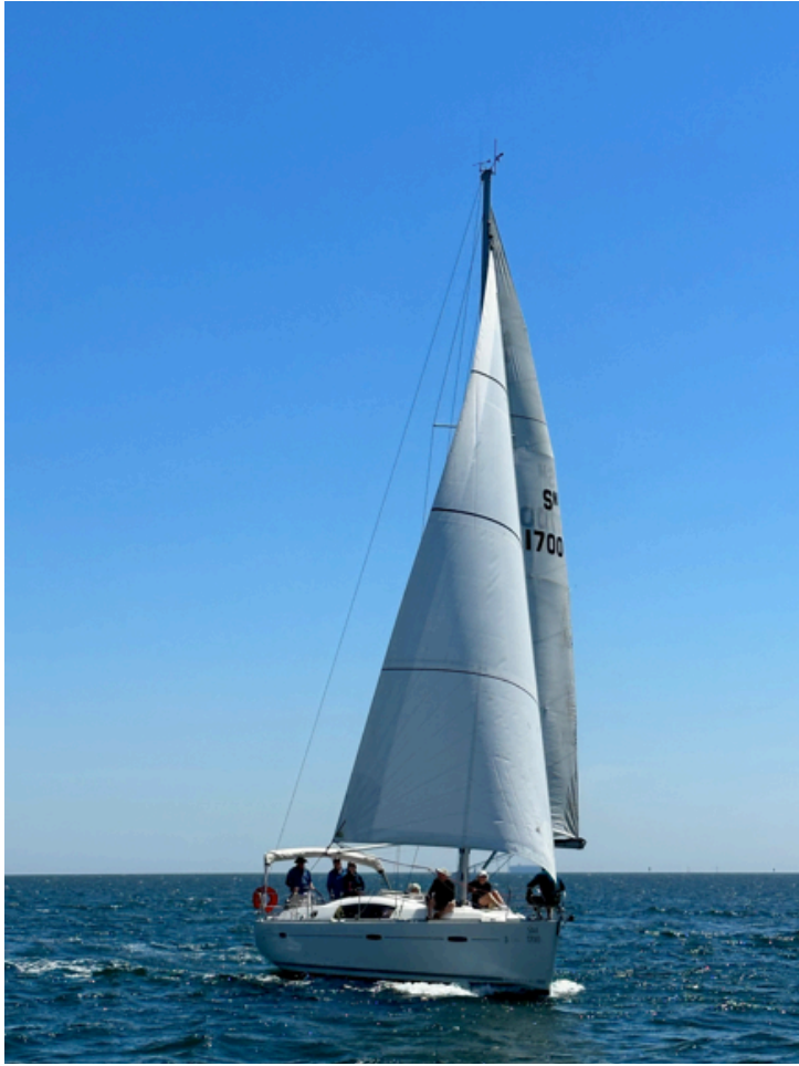
5 O'clock Somewhere – still on the top of the aggregate competition