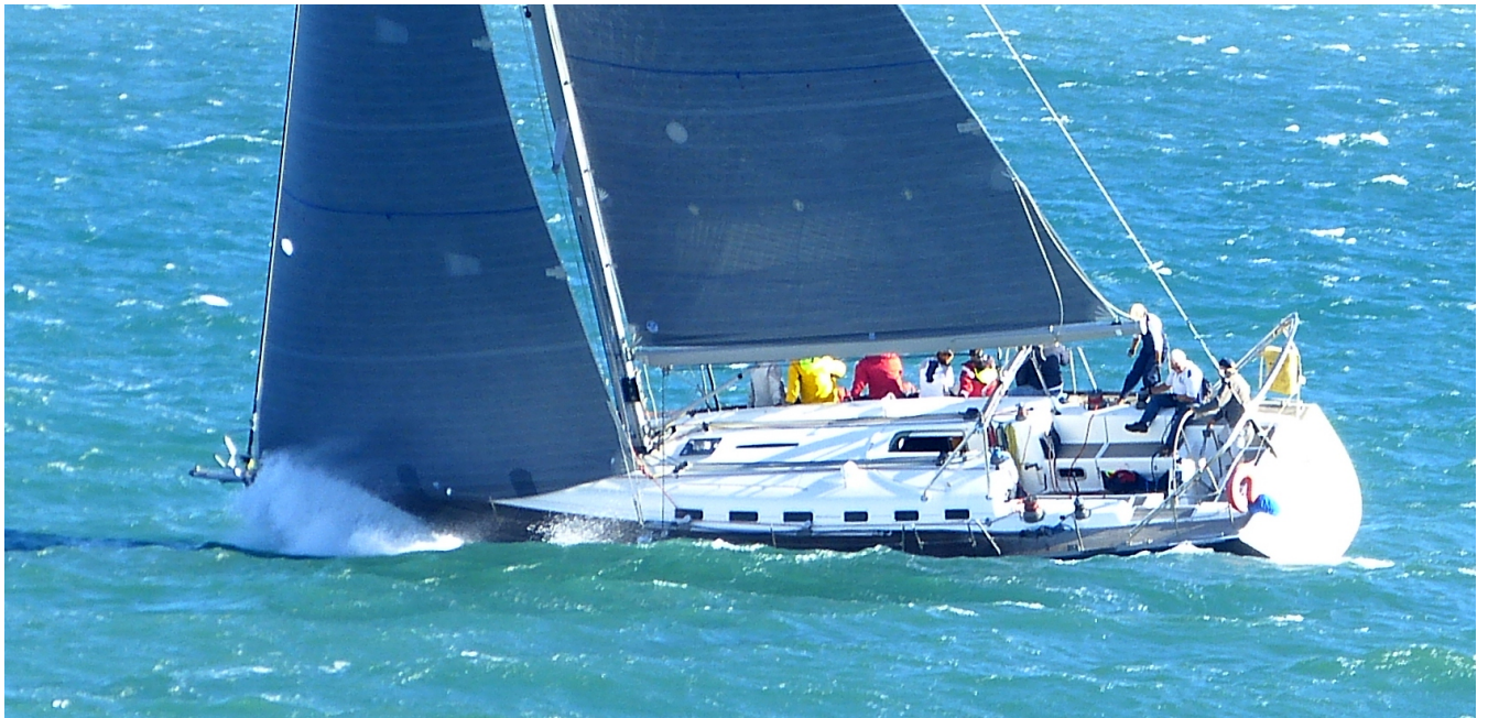
Esprit cracking the pace to record the fastest time.