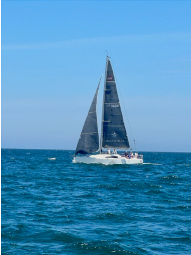
Maverick – start of the day at 1 sec