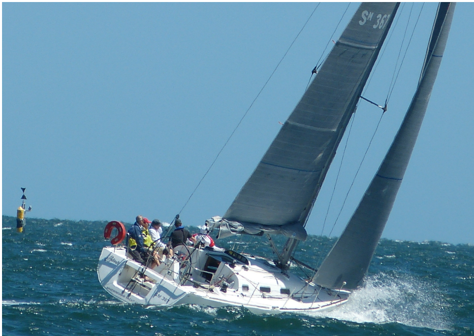
Lebrok - 1st across the line