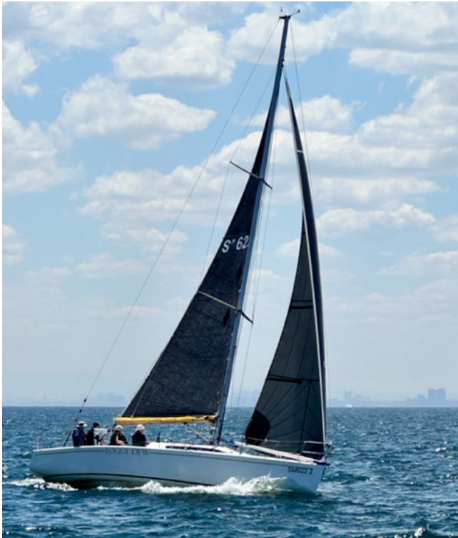
Foggy Dew – 2 nd in the aggregate series (on count-back); equal points to series leader.