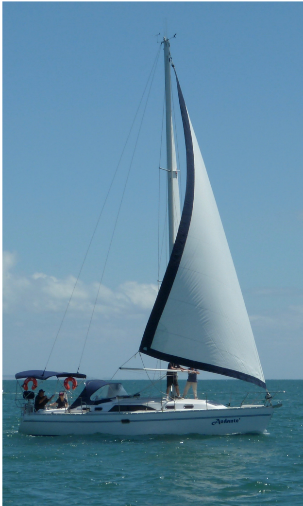
Andante 1 on her way to 2 nd place