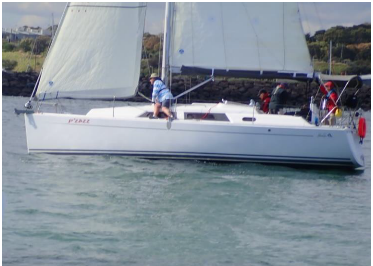
Pzazz on her way to 1st across the line