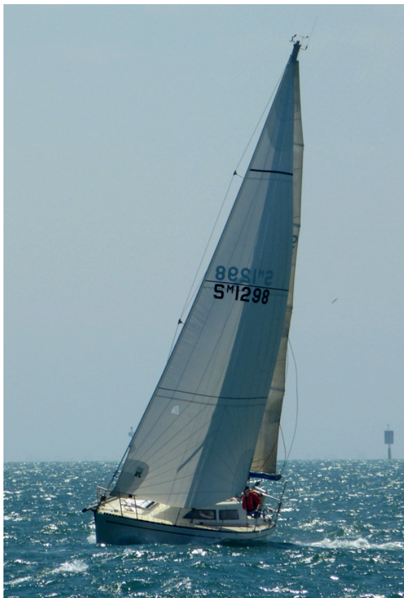
Saltshaker sailing comfortably into 3 rd place