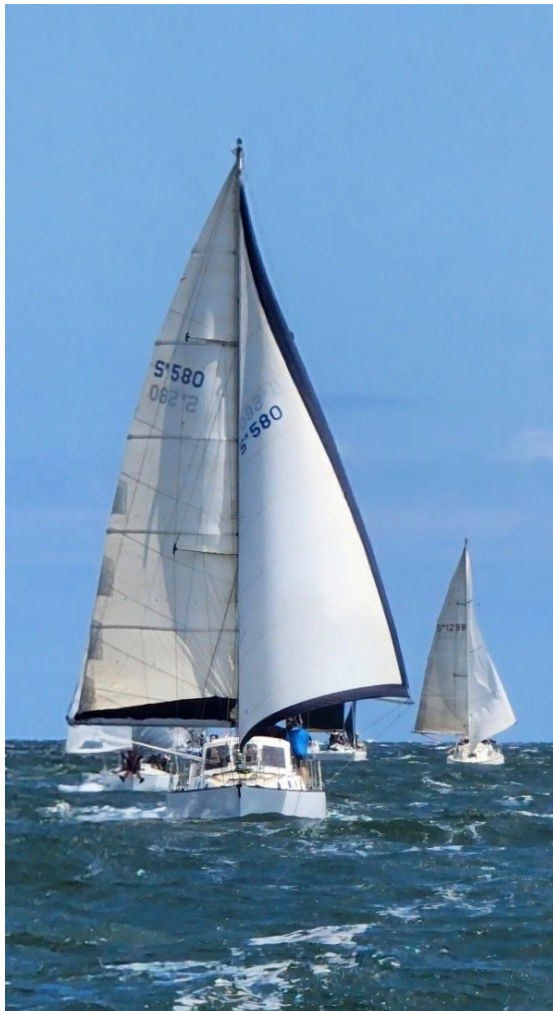
Summer Wind on her way to 1st across the line