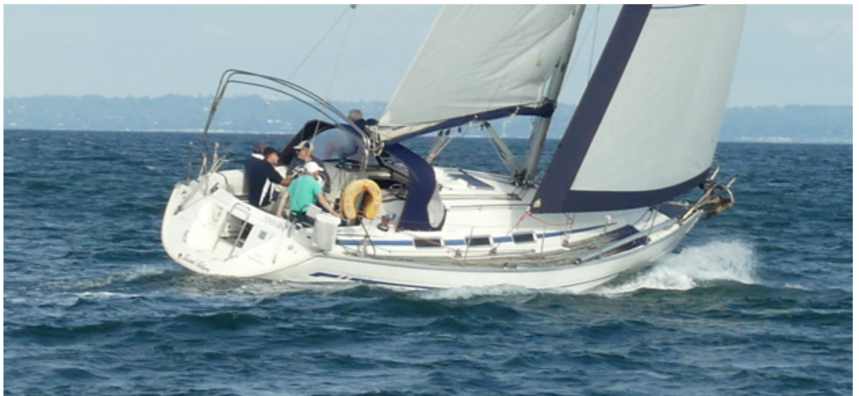
Second Nature sailing comfortably into 3 rd place