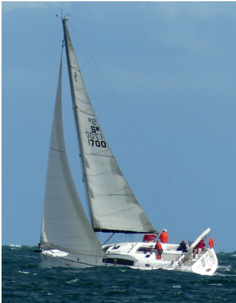
5 O'Clock Somewhere on her way to 2 nd place