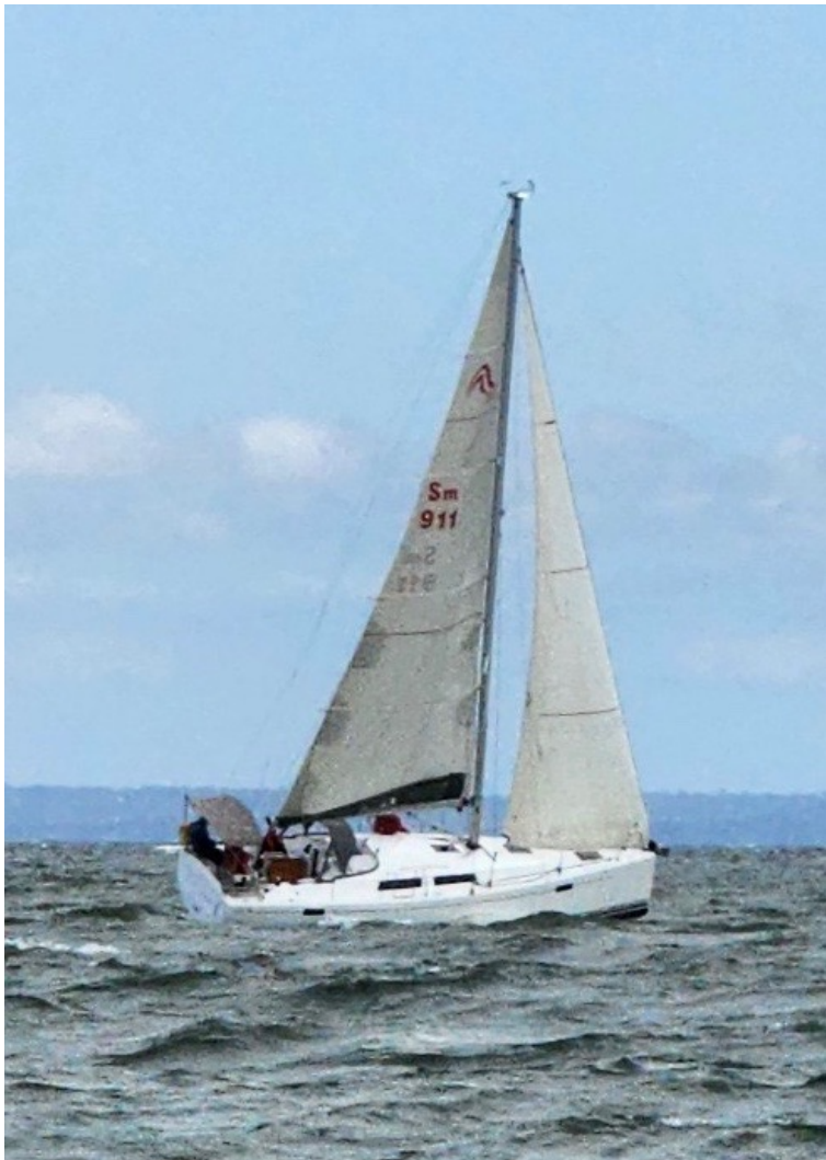
2 nd - Roller Coaster - on the way to SYC 5 (and a long way from the photographer)