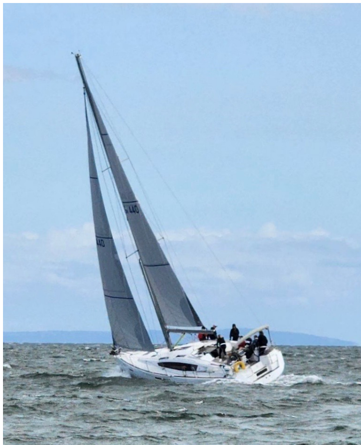
1 st - Skullduggery on the way to SYC 1