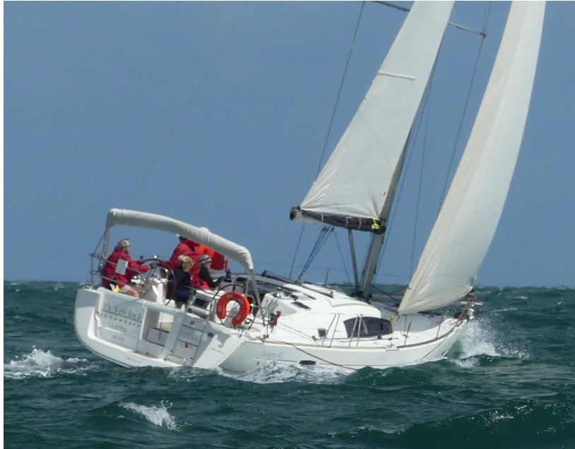
5 O'clockSomewhere – remaining in 2 nd position in the aggregate competition