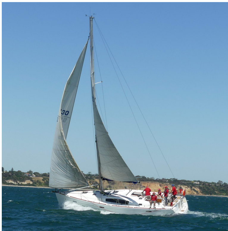
White Pointer – 1 st

To add to their injuries, they were denied the honour and applause of being able to collect any glassware for this race.