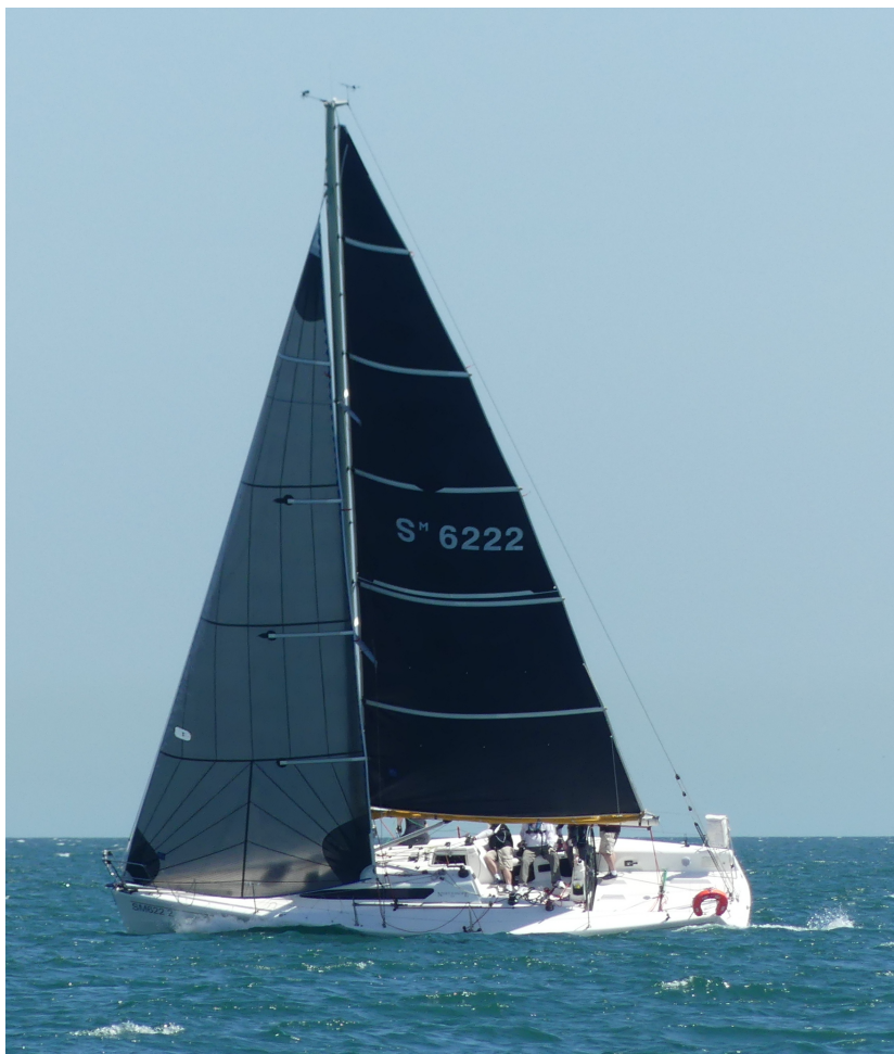
Foggy Dew – 5 th to finish, 3 rd on points