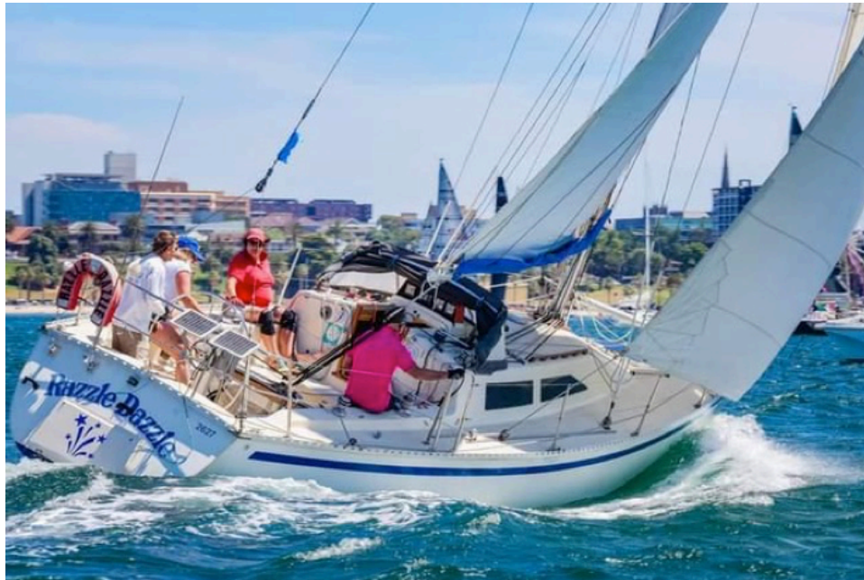
Yacht in profile – Razzle Dazzle