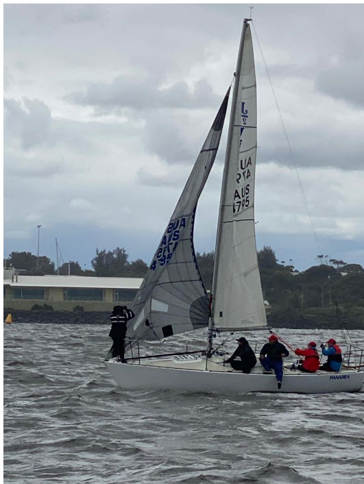
Panarea – 2 nd