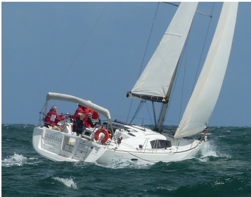
5 O'clock Somewhere – Leading the Aggregate