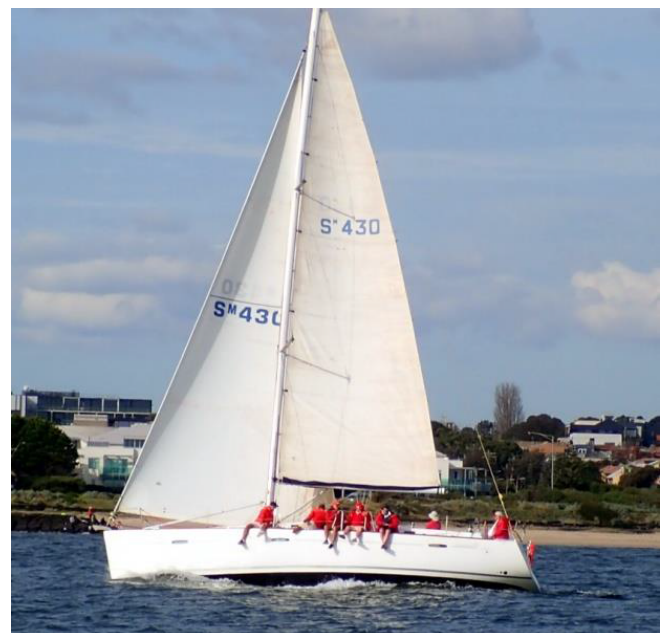
White Pointer – 2 nd