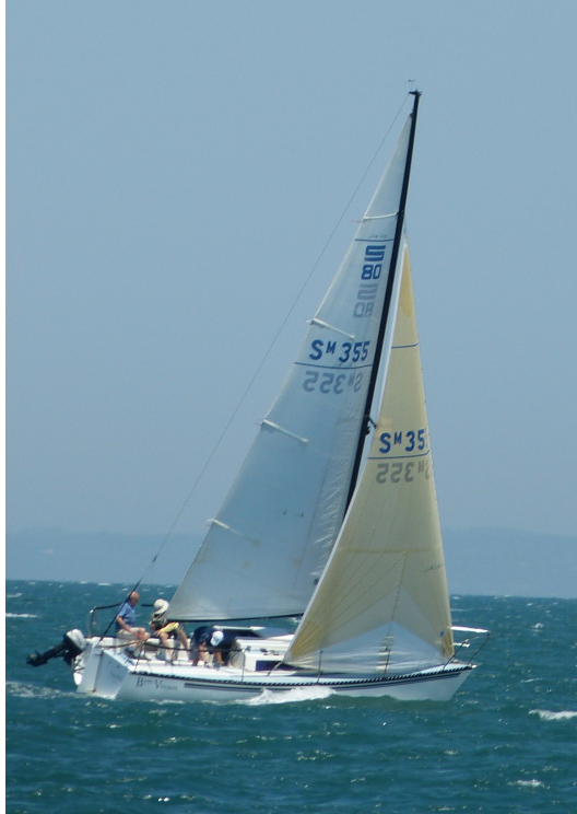
Bon Vivant – 3 rd