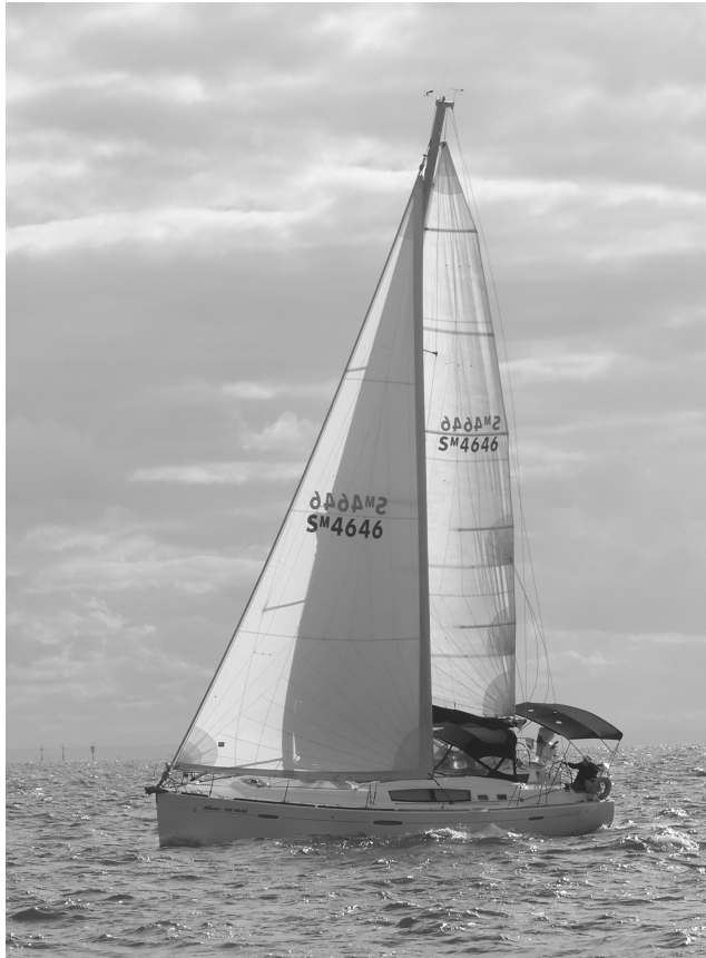
Alliance – Leading the Aggregate