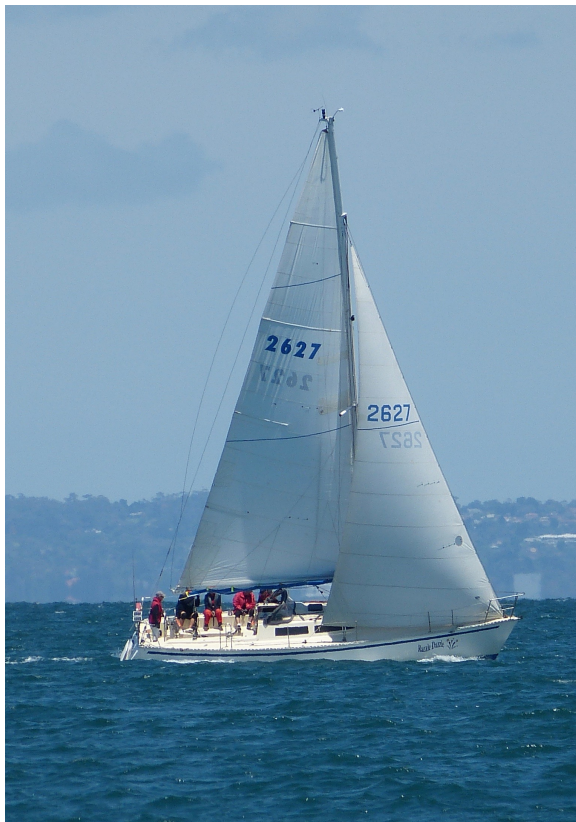
Razzle Dazzle – 1 st