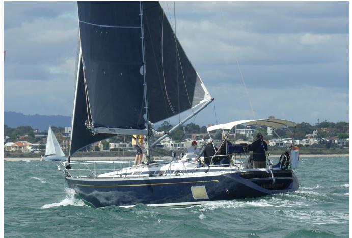
Equal 3 rd - Vixen 1