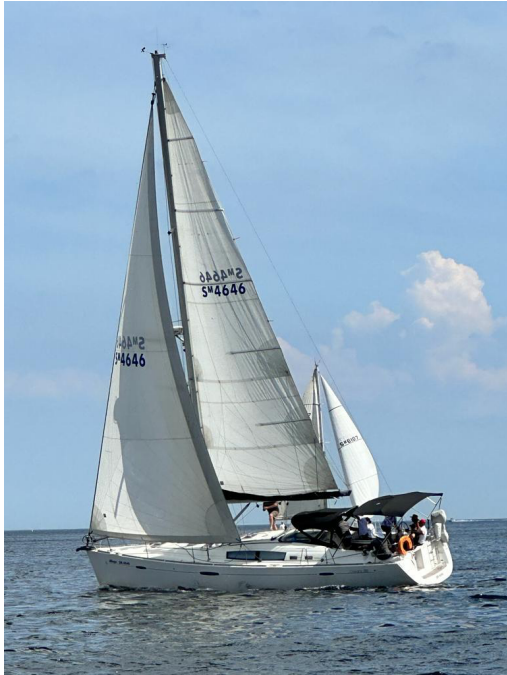
Equal 3 rd - Alliance