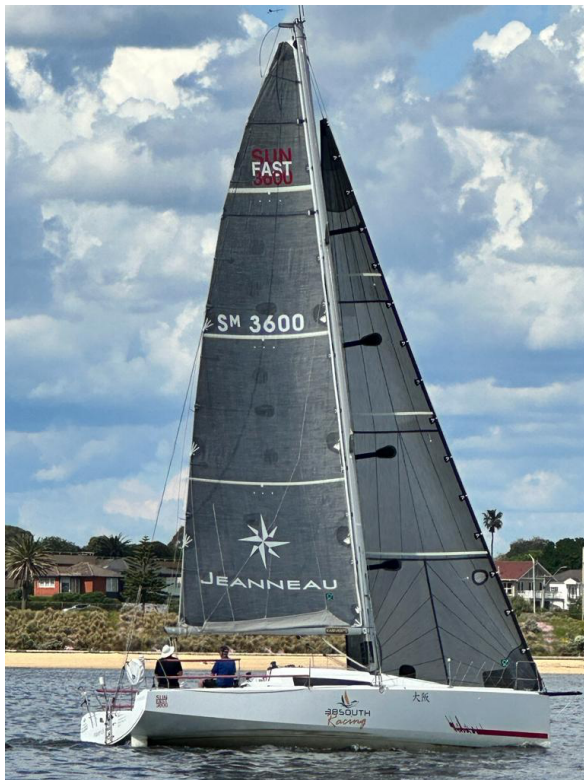
1 st - Maverick