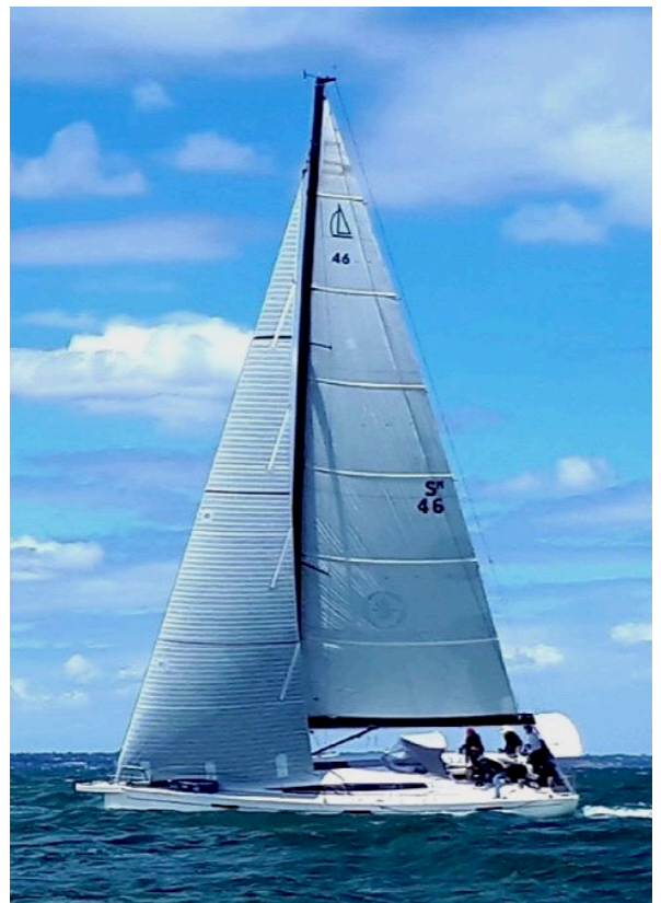
2 nd - Hot Chippys