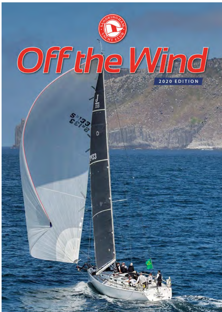
>> Front Cover