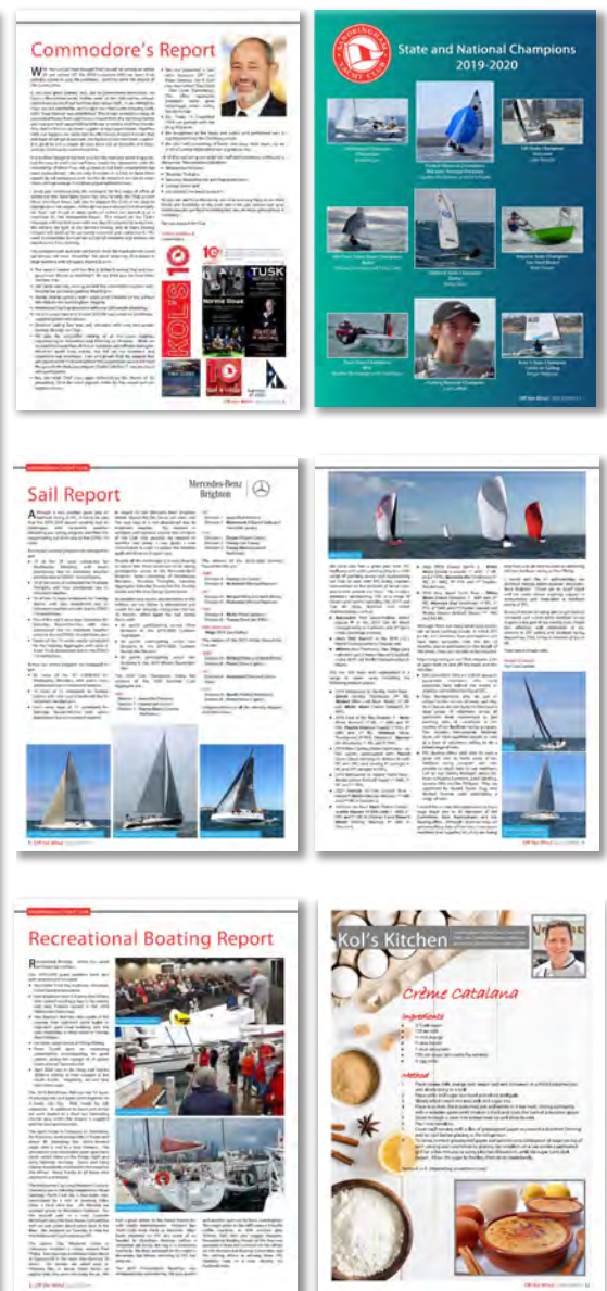
>> Inside Pages