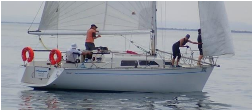
(Right) HOT CHIPPS & THE SECRETARY make a slow approach to SYC 7.