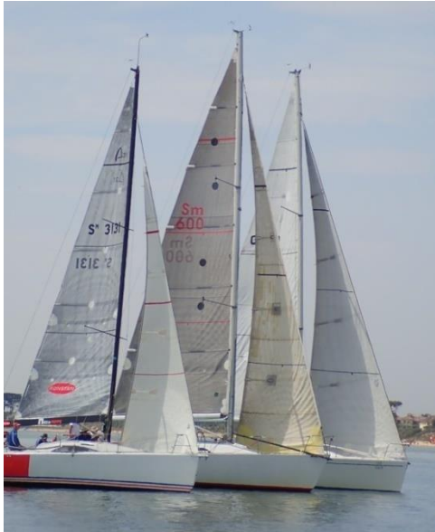
(Left) ARCH DE TRIOMPHE, FUN & GAMES & PEGASUS in tight formation.