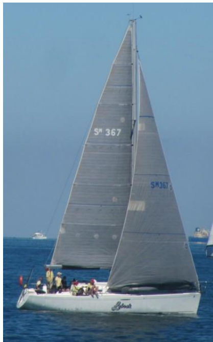
(Above) RAZZLE DAZZLE with LEBROK (left) & FOGGY DEW (right)