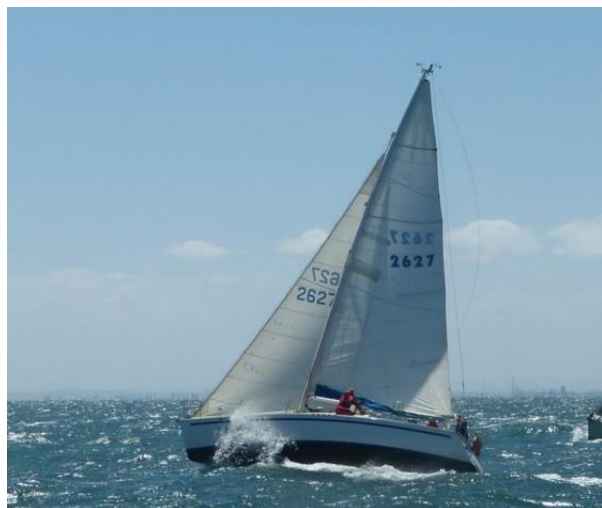
(Left) RAZZLE DAZZLE

Although they have accumulated 164 races between them there are 18 yachts in the aggregate without a podium finish between them. The list includes RAZZLE DAZZLE with 16 races currently 8 th in the aggregate; MAGIC with 15 races and 19 th in the aggregate; SECOND NATURE with 14 races and 2 nd in the aggregate; and, INSX also completing 14 races and 4 th in the aggregate.