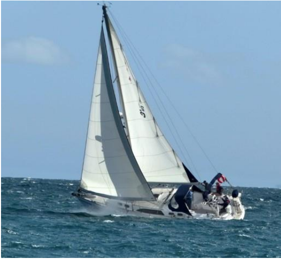
(Left) ANDANTE 1 finished 3 rd in the first race of the series.