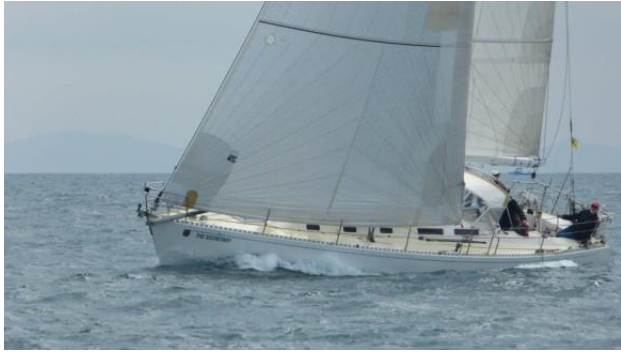
(Left) THE SECRETARY is also the current leader of the summer aggregate.