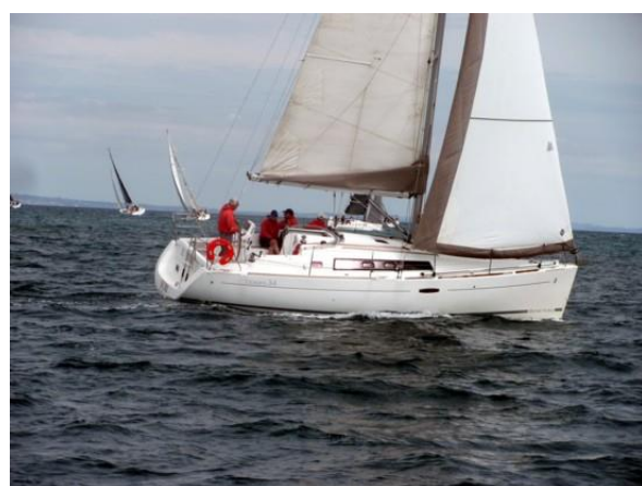
(Left) SURI on her way to complete her 3 rd race of the series.