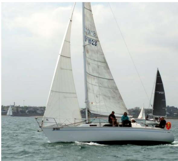
(Left) ARABESQUE has completed all 4 races in the series and is currently 27 th in the aggregate.