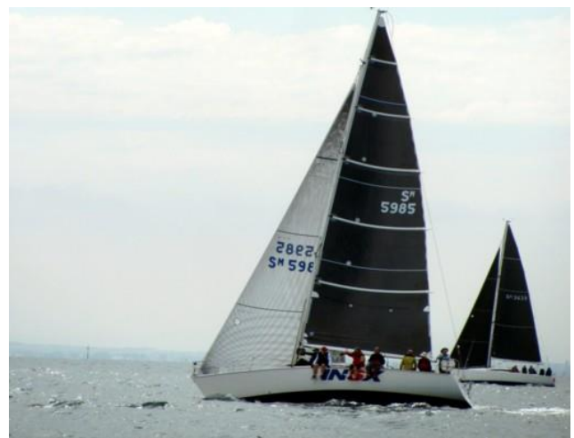
(Right) INSX is back sailing the summer series after missing the winter series.