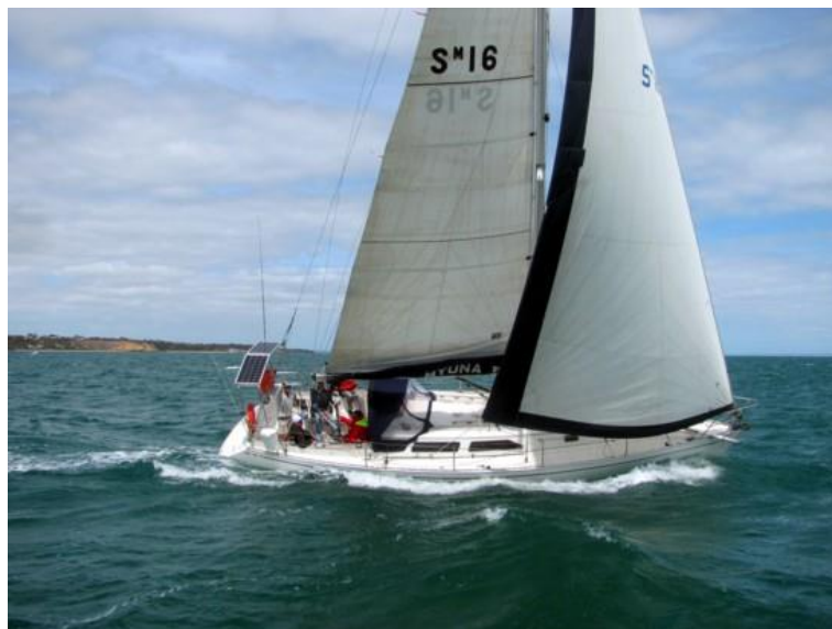
(Below) MYUNA III