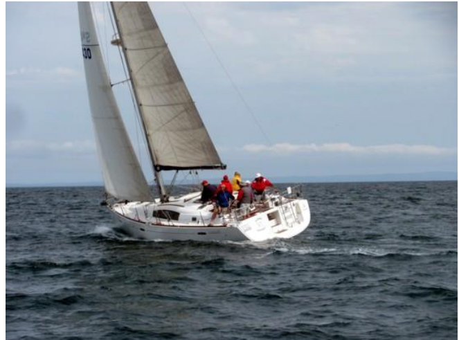
(Right) winner of the 2017-18 Summer Aggregate WHITE POINTER is 16 th in the current series aggregate.