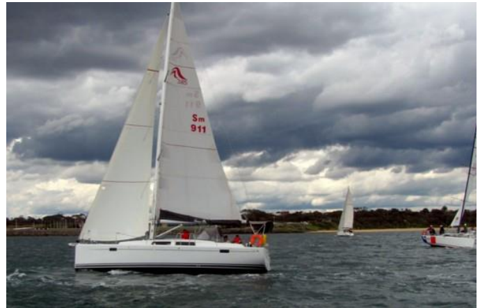
(Right) ROLLER COASTER has completed 3 races and is 17 th in the aggregate.