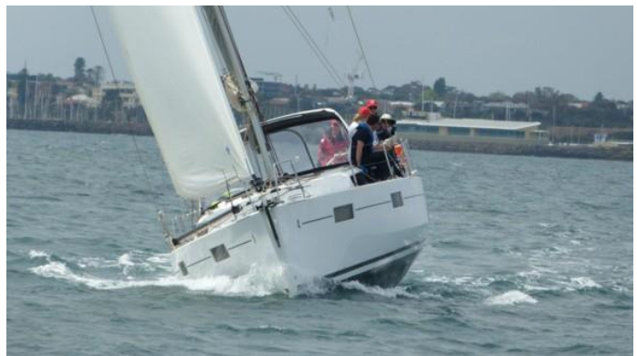
(Right) HOT CHIPPS finished 15 th in race 5 and is 6 th in the aggregate.