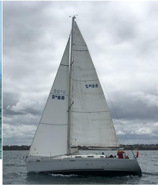
UPBEAT was arguably the best on the day starting from 21 st place and rounding SYC 4 in 6 th place.