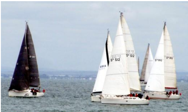
(Left) Only SCALLYWAG was able to overtake LEBROK.