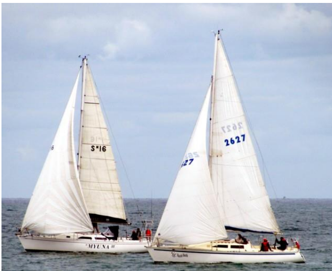
(Below) MYUNA rounded SYC 4 seven seconds ahead of RAZZLE DAZZLE.