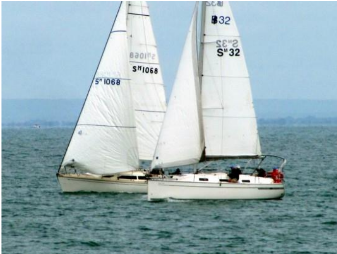
FOGGY DEW had the best start but was overtaken by COPYRIGHT.