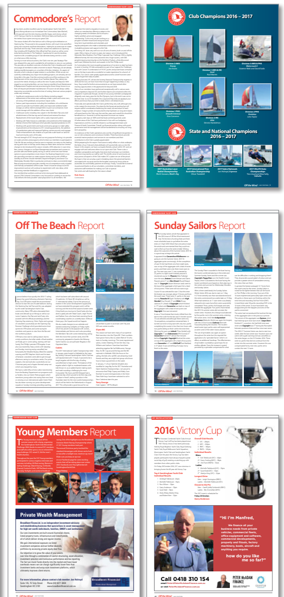
>> Inside Pages