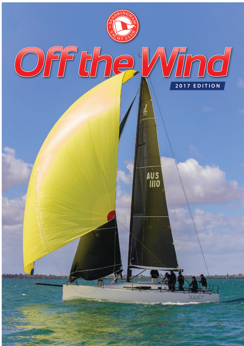
>> Front Cover