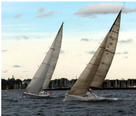
Yacht Number Two