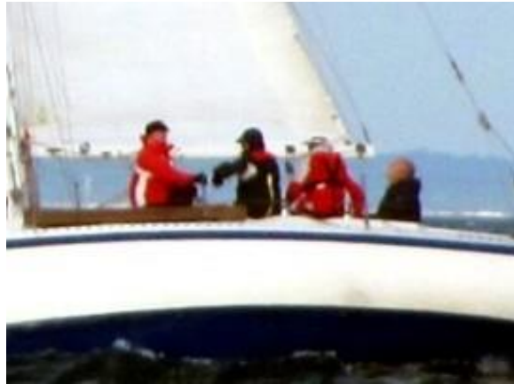
Yacht Number One