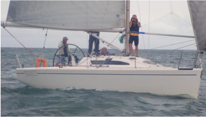
PEGASUS (Flying Horse) & new tender. She finished 4 th in her first WW race.