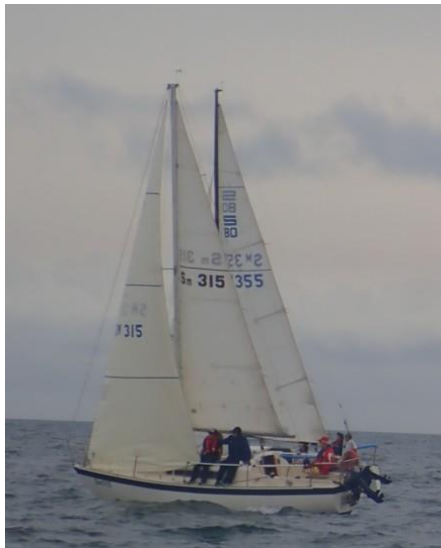
(Left) BON VIVANT finished ahead of WILLARIE with LEBROK (right) crossing the line in 5 th place.