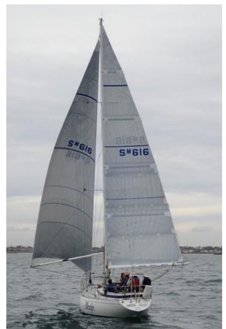
MAGIC (right) started 13 th and finished 18 th .