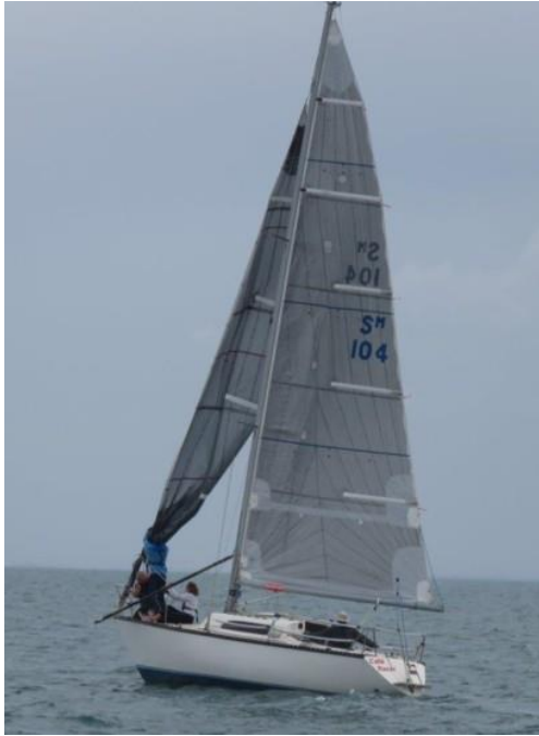
Foresails receiving attention on CAFE RACER (left) and RAZZLE DAZZLE (below).