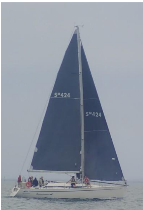
BARNSTORMER (left) started 30 th and finished 14 th .