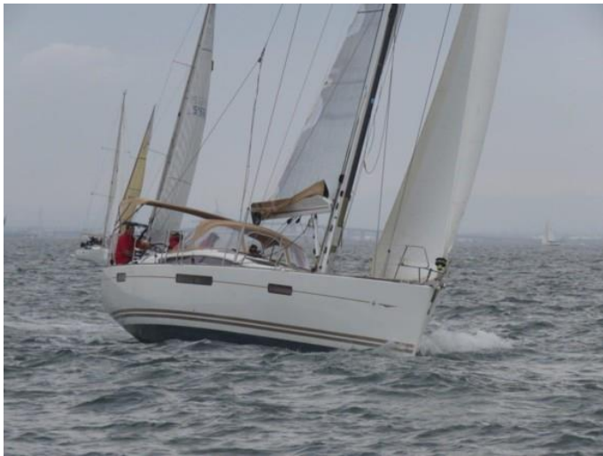
(Left) LADY J finished 24 th in her first summer series. WHITE POINTER finished 22 nd .