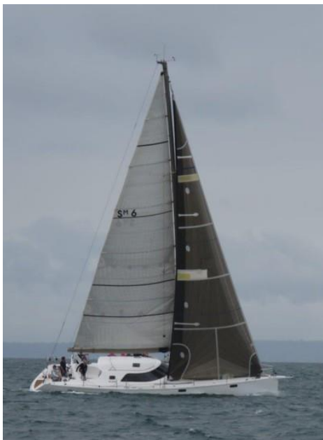
STAMPEDE (left) displaying well trimmed sails whilst PIPPA (below) takes things easy.