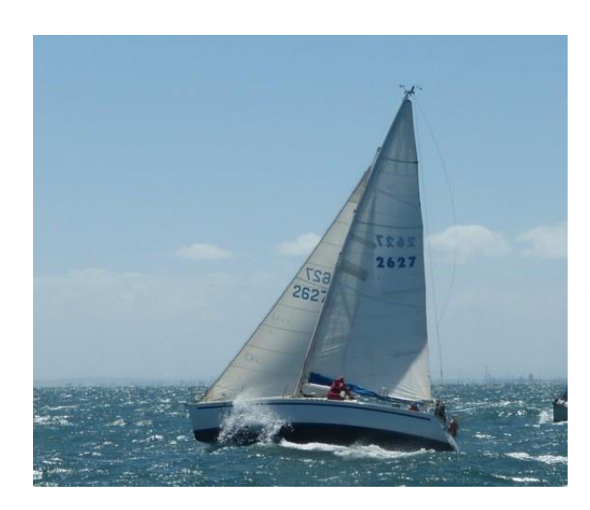
(Left) RAZZLE DAZZLE

Although they have accumulated 164 races between them there are 18 yachts in the aggregate without a podium finish between them. The list includes RAZZLE DAZZLE with 16 races currently 8<sup>th</sup> in the aggregate; MAGIC with 15 races and 19<sup>th</sup> in the aggregate; SECOND NATURE with 14 races and 2<sup>nd</sup> in the aggregate; and, INSX also completing 14 races and 4<sup>th</sup> in the aggregate.