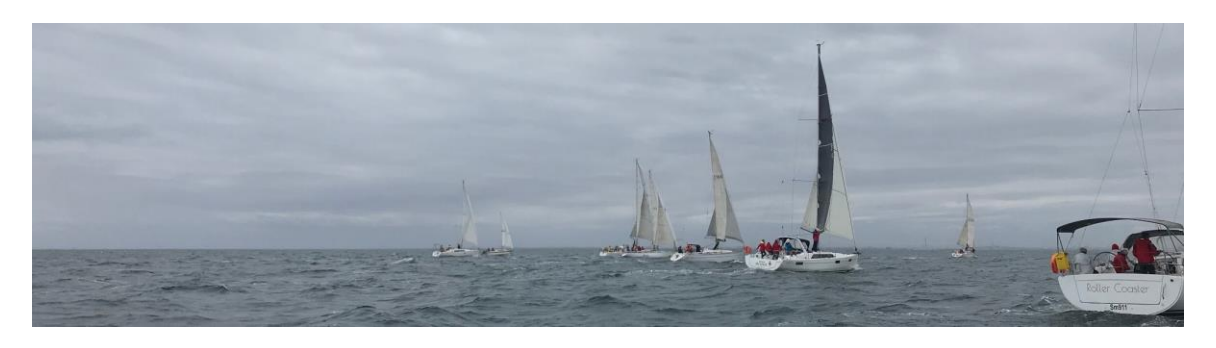
A big spread going down wind to No 7. Look carefully for a Triton

By contrast 11 yachts made more use of the pleasant weather and spent over 2 hours sailing the course.